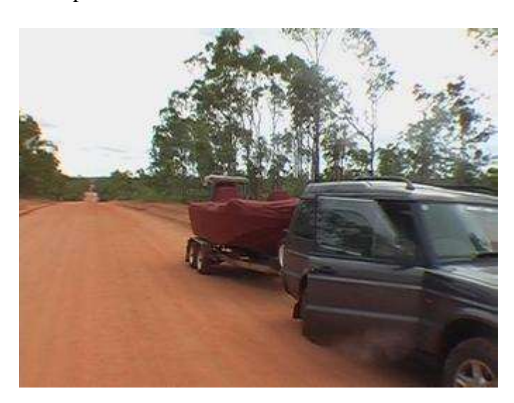
on the road to Weipa

It will be based on his recent family trip to Weipa and will cover preparations i.e.:boat trailer, boat, car etc as well as the quality of fishing which can be expected in Weipa. He will have a DVD presentation as well as slides if needed.