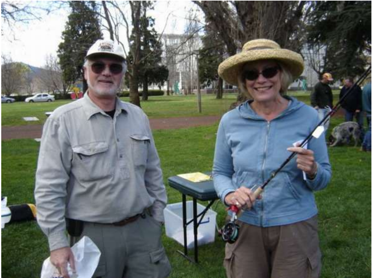
the lucky Raffle Winner - unnamed.