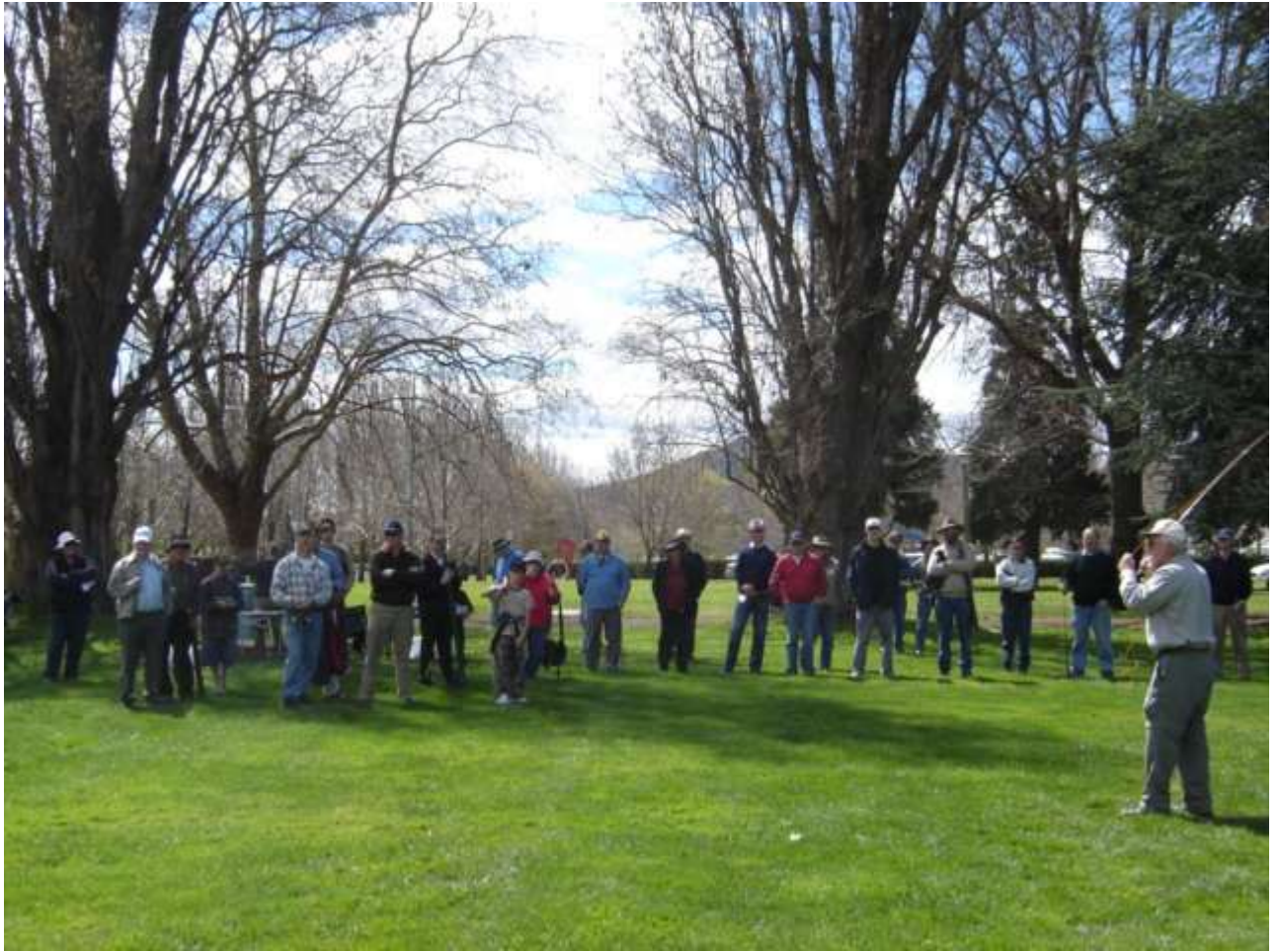
Some Images of Stuart conducting class.