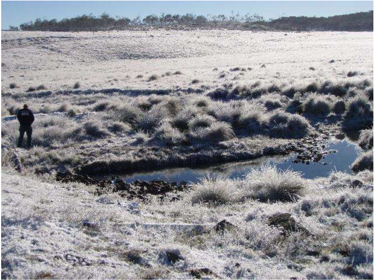
Upper stretch of Murrumbidgee with Alan making a contribution

It was a great day with Les getting his first trout on fly (reportedly a 10 inch Rainbow on a woolly bugger). Many fish were sighted in the river - up to 100 good sized fish in one pool milling around the bottom, but few fish of any size were tempted to our flies.