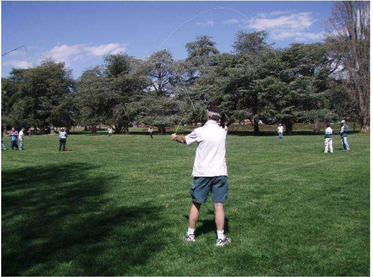
Despite being the foulest weather, a large (16?) gathering turned up for the Eucumbene Trout Farm excursion.