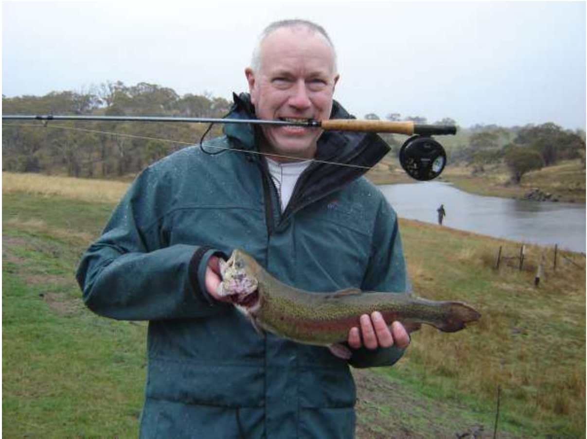
A couple of nice fish were extracted from the big lake.