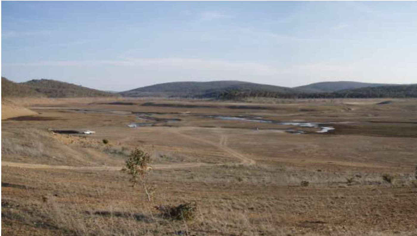
Panorama of the Eucumbene River at Providence Portal (Portal stream on left) - where has the Lake gone !

Underwater shot of Bill's 43cm Rainbow Jack - note that you can't see the fluorocarbon tippet attached to the glowbug in his mouth.