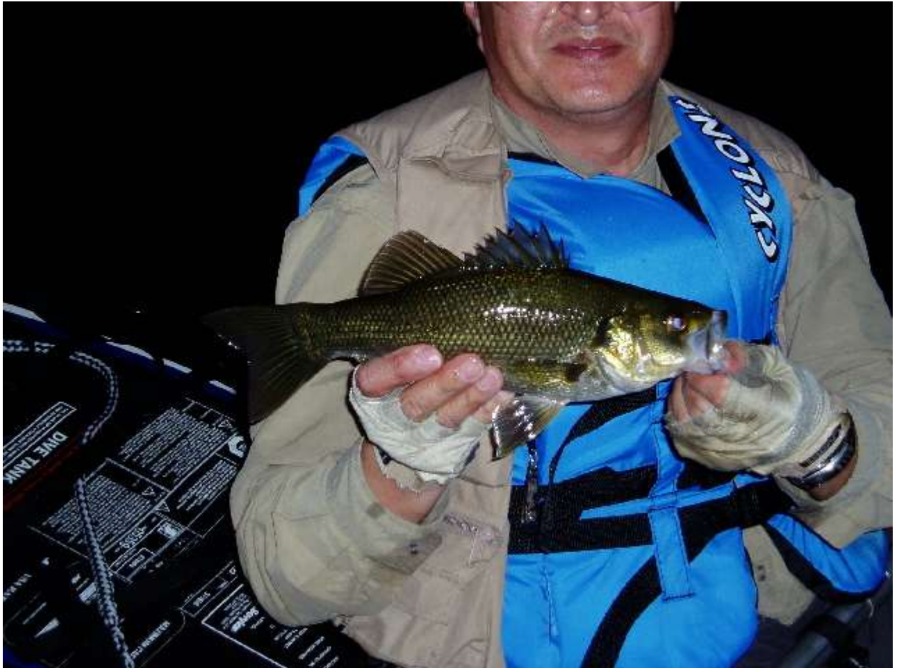
One of the bass taken just on dusk