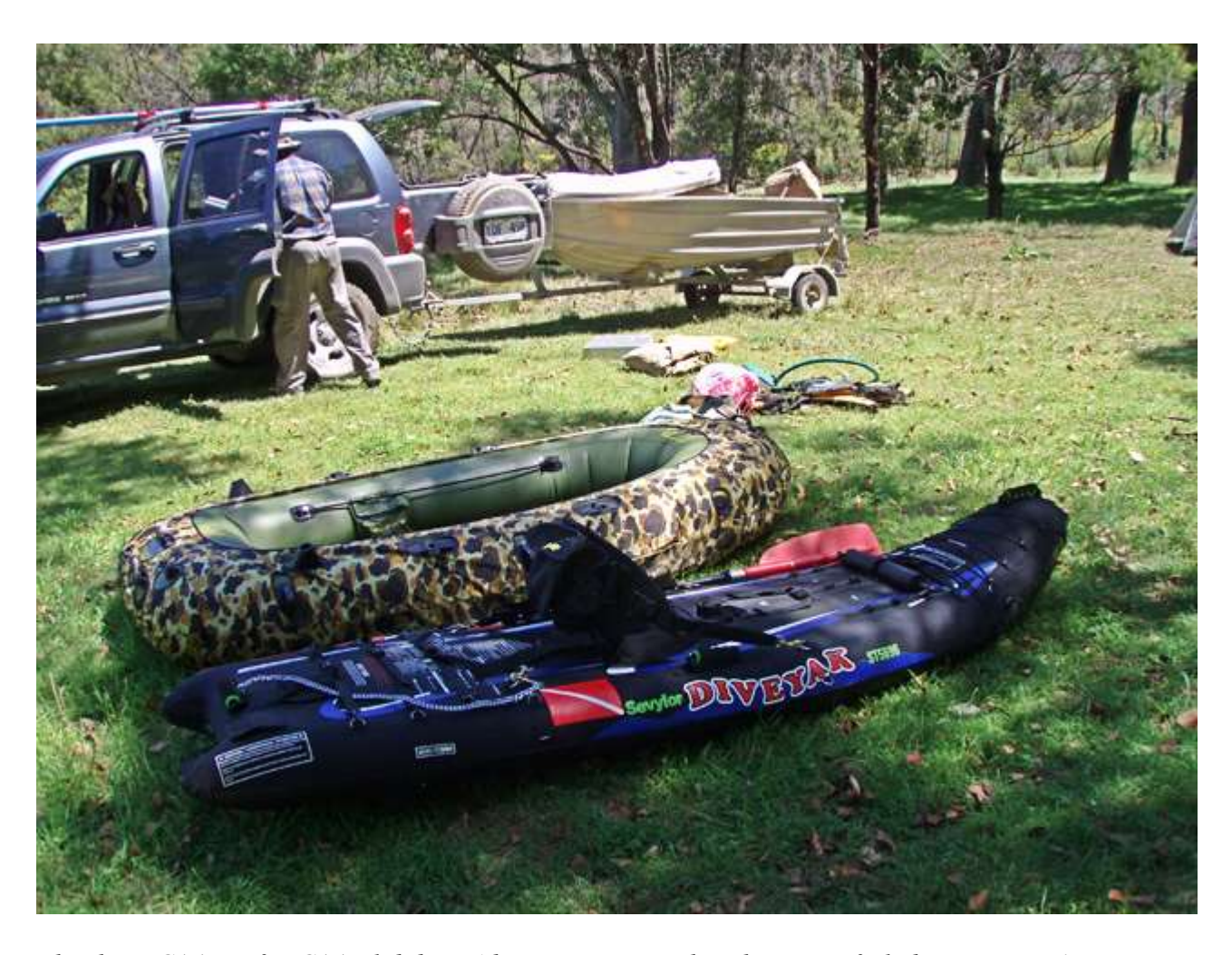
The three CAA craft - CAA club boat (disappointing in that the motor failed to start, Ian's ducky and Bill's kayak