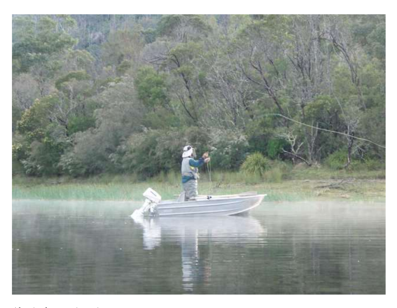
Alan in the morning mist