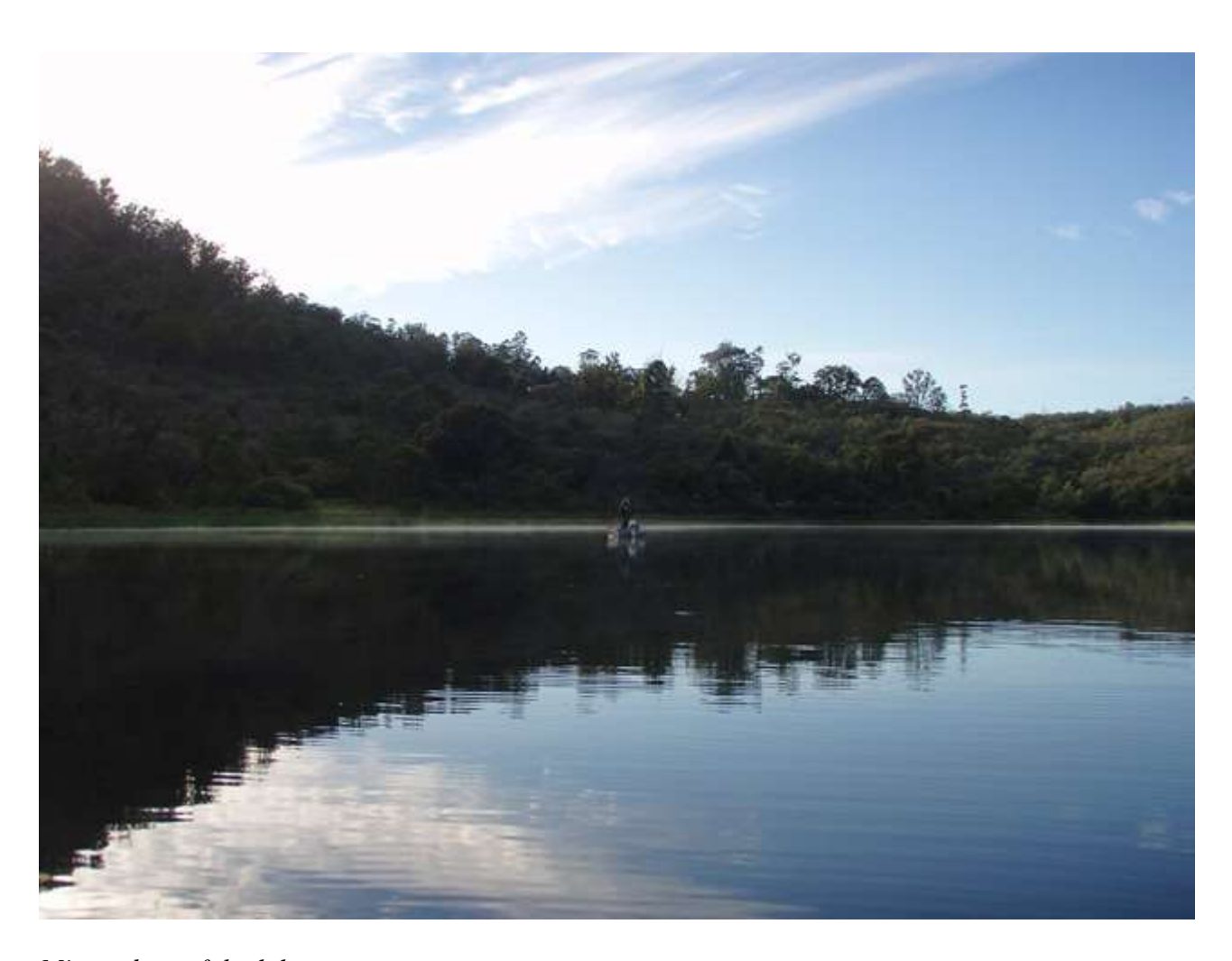
Misty edges of the lake