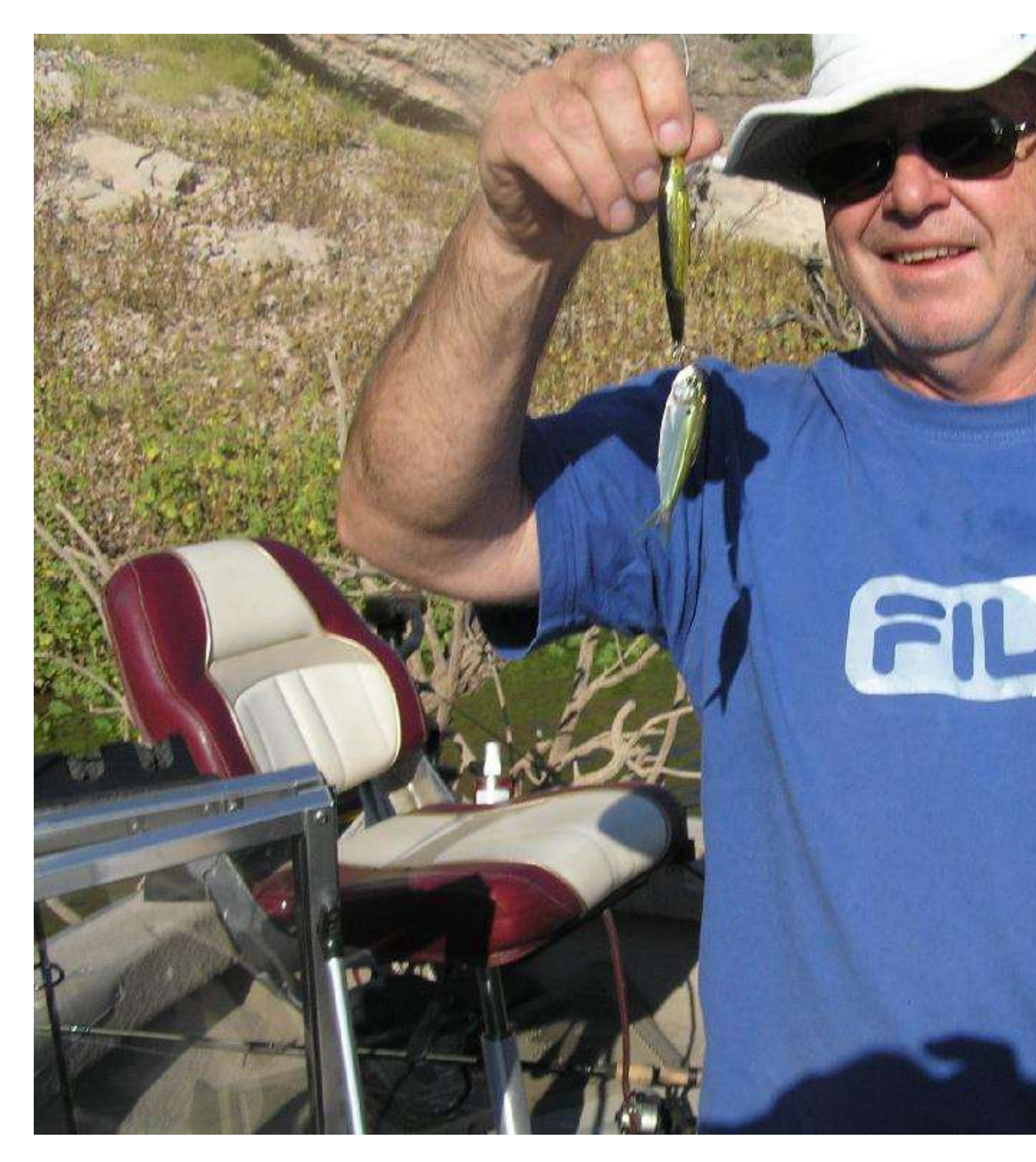
Seems there was also a large contrast in boat styles: