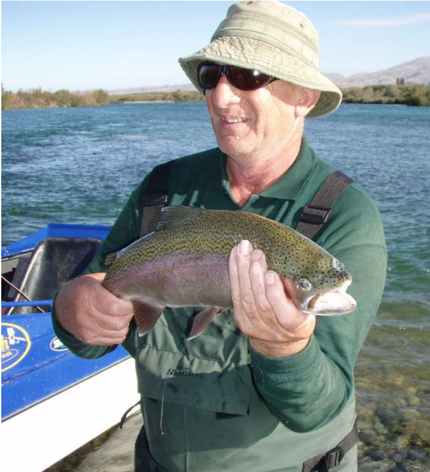
Waitaki rainbow - best fish of the trip