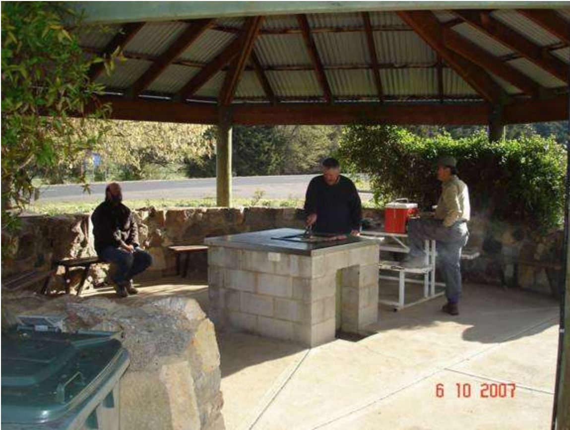
At the barbeque.