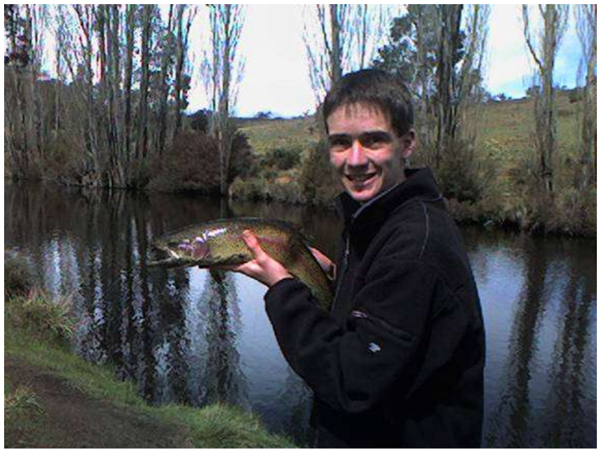
it was the thredbo, at the kosciuszko road bridge past jindabyne. caught im on a brown wooly bugger(same fly caught a legal brown in the murray at tom groggin the day before) fished deep. i did get the measurement... 56cm. need anyother info?