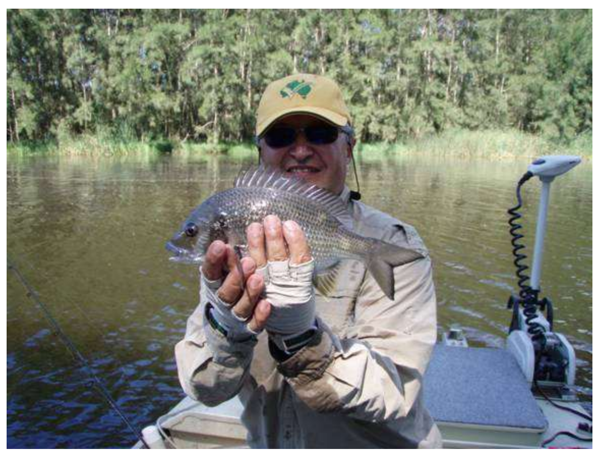
some bream by-catch.