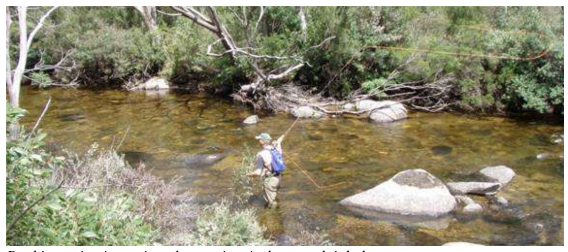
But his casting is coming along quite nicely – good tight loops.