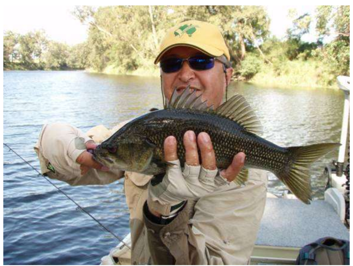
both strong bass and ..