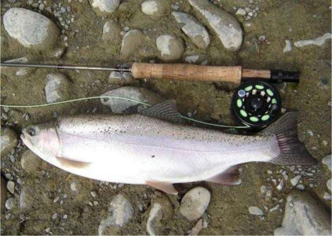
A superbly conditioned rainbow caught by Ian in the Ahuriri River below Omarama.