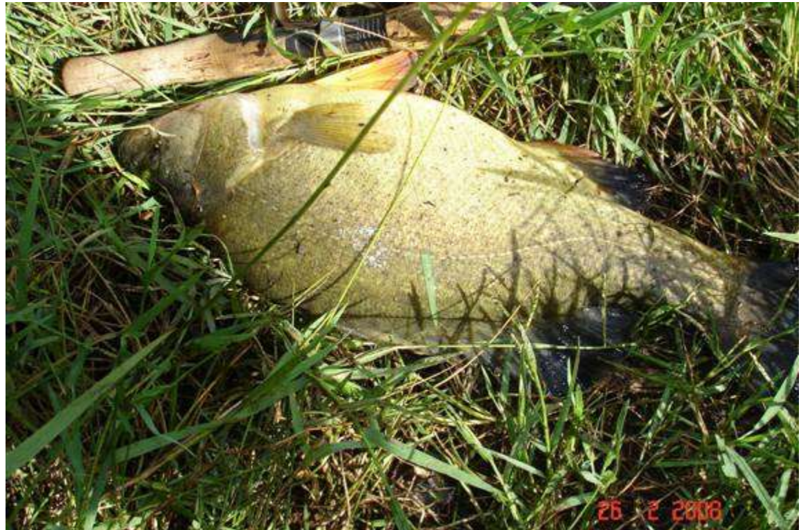
44cm Yellowbelly caught on soft plastic (split tail minnow) in Lake Tuggeranong this morning (26/2/2008)