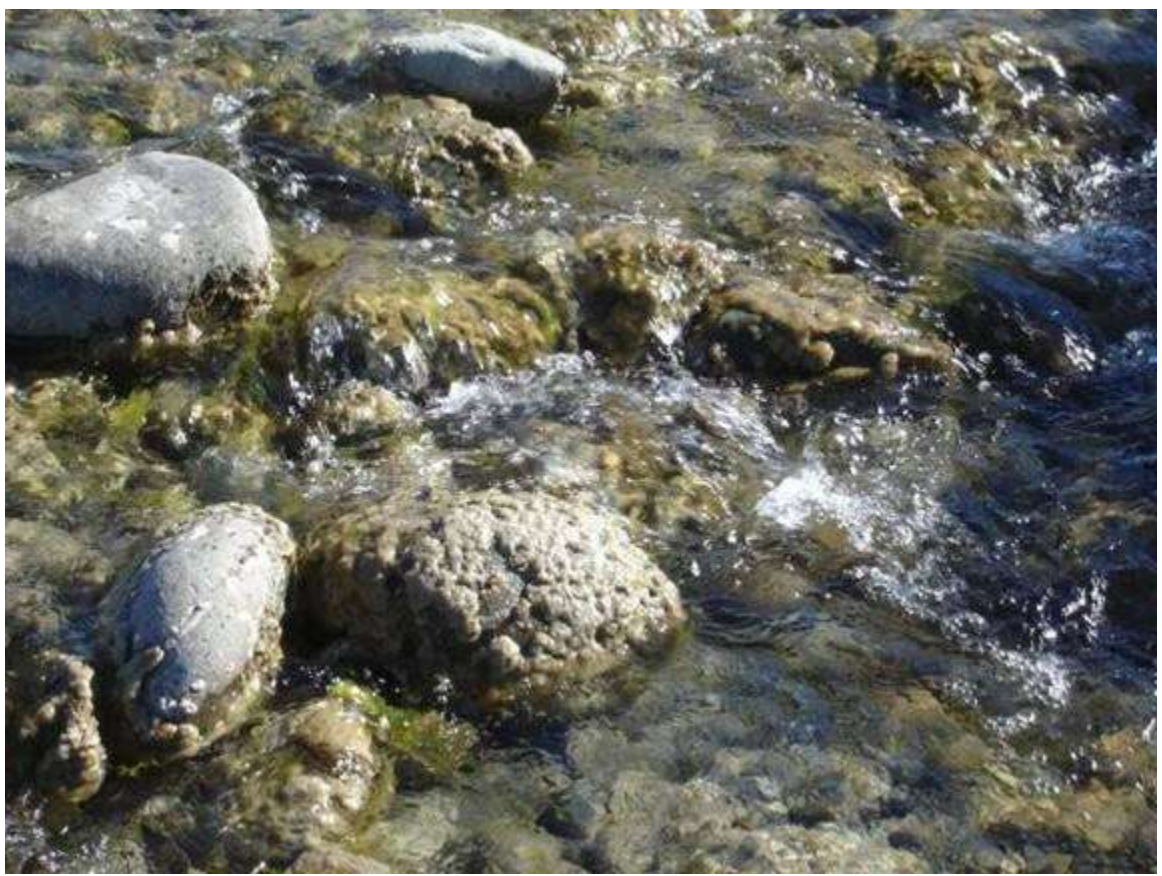
Didymo was particularly bad in a section of the Ahuriri about 10 km above Omarama.