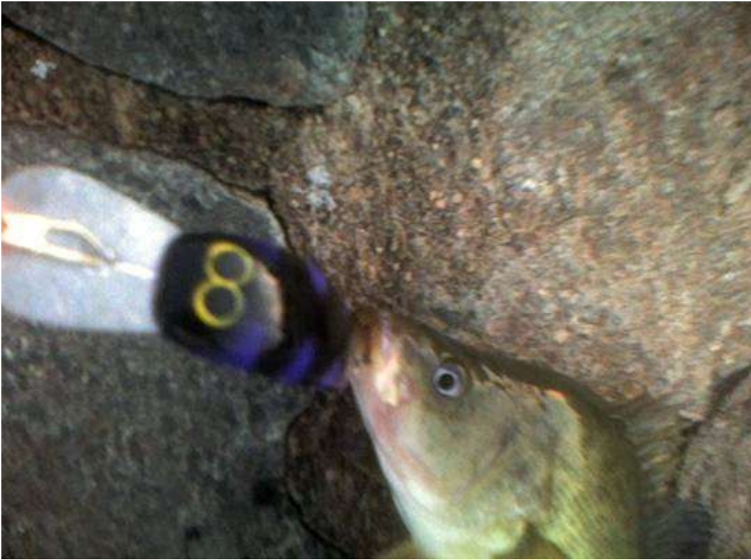
My first Yellowbelly from Lake Tuggeranong.