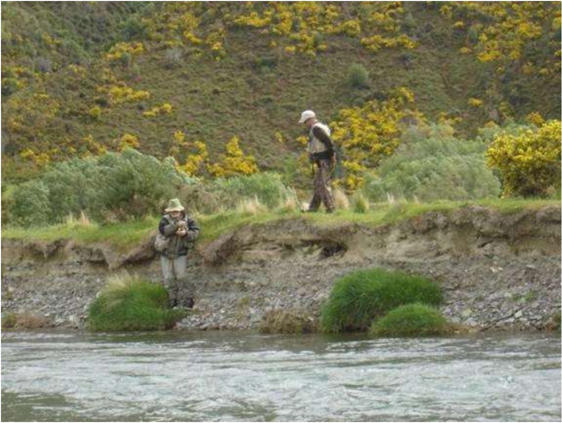
Stuart with nice brown spotted by guide Nigel