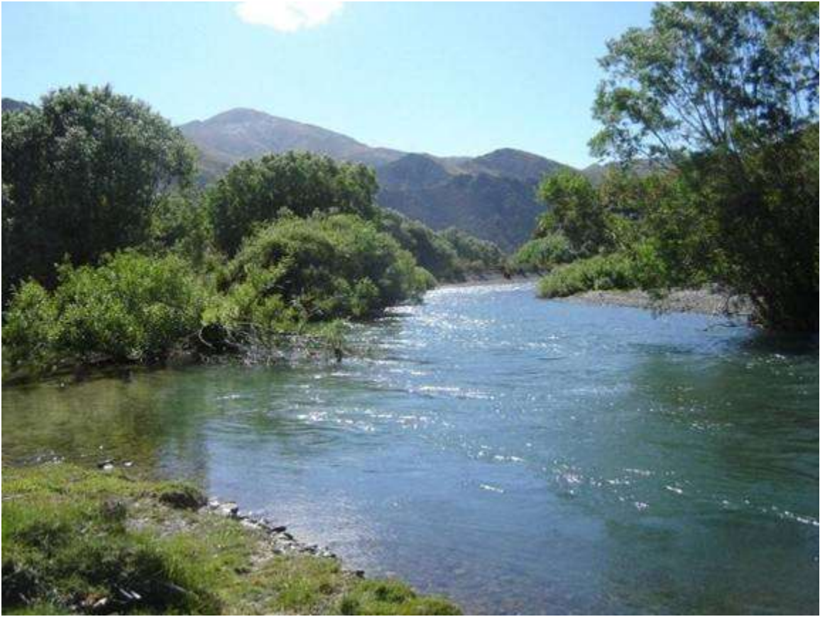
Mataura River, with backwater on left where the fish [was] caught