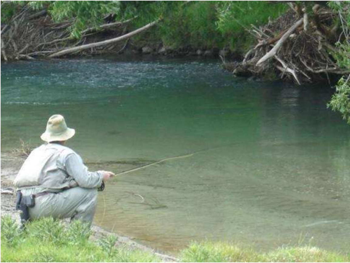
Lovely spot, nice fish, many casts, not interested