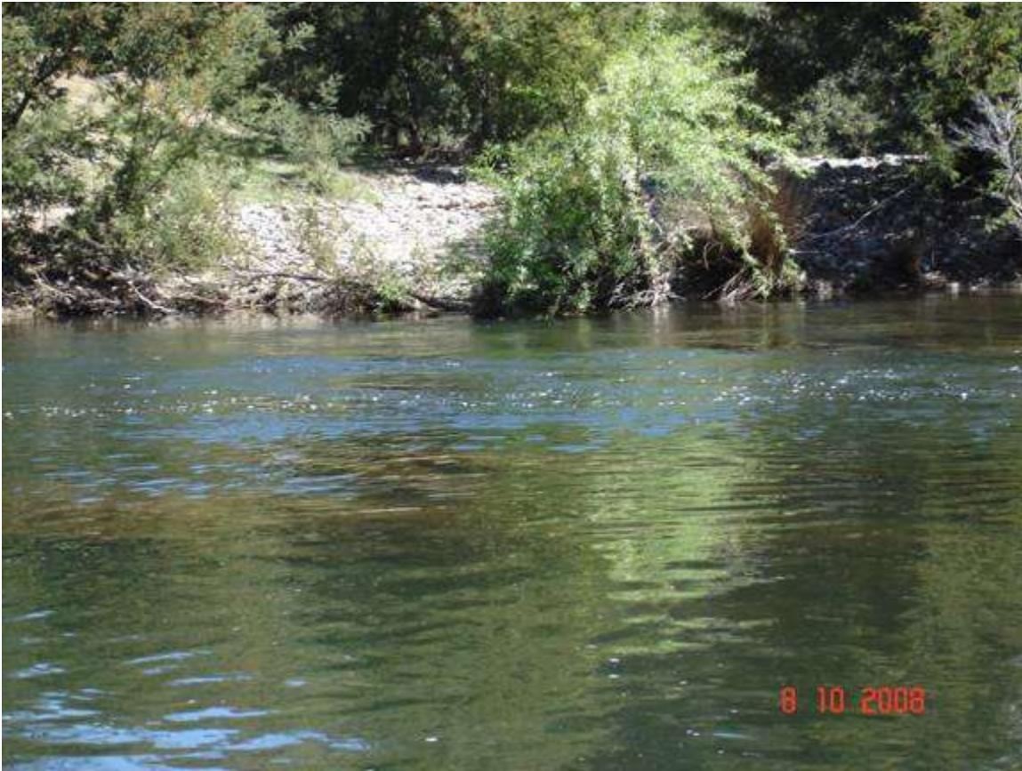
photo of the Goodradigbee river with plenty of water and plenty of fish (caught approx 30 between the camping ground and the old windmill) but all were small fish with the best taken being just on legal size).