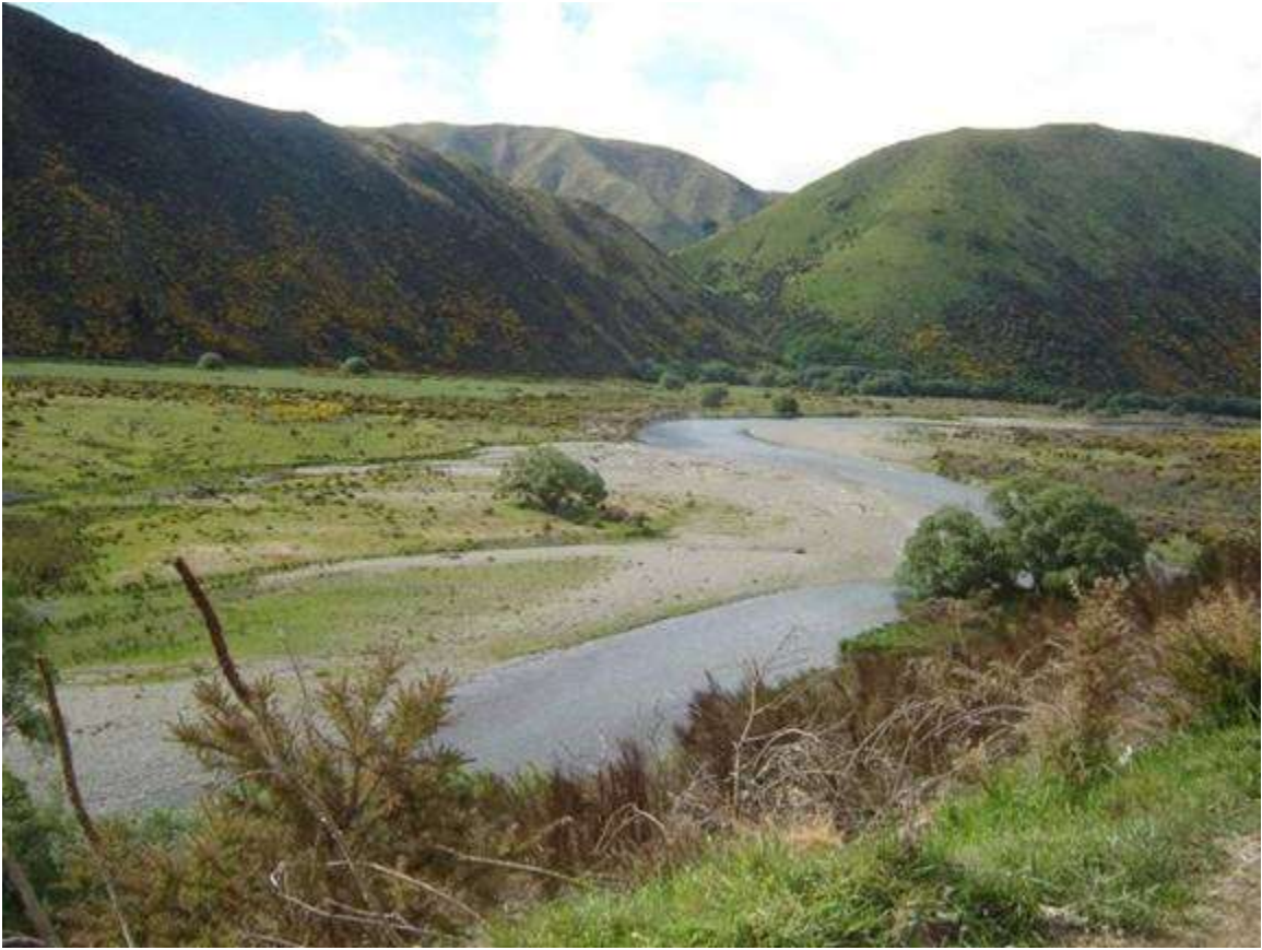
Maitava River as it runs through Nokomai Station