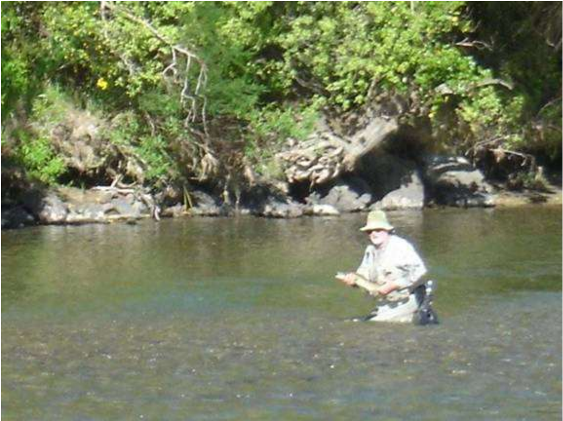
Stuart with nice fish tempted after quite a few casts