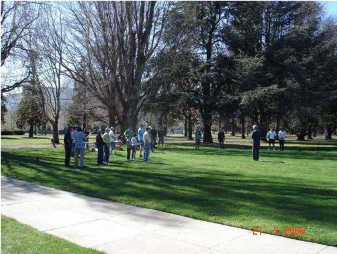
casting day 2 with Mark addressing the potential fly casters.