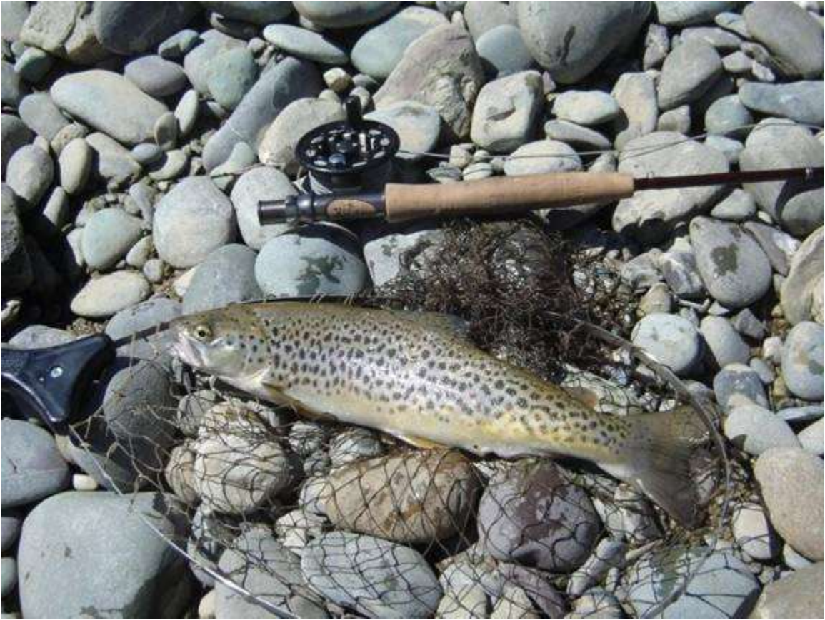
Nicely marked brown, taken by sight fishing in backwater off Matura