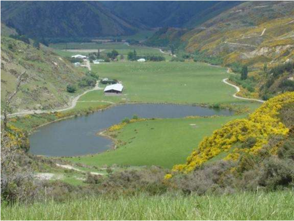
Nokomai Valley, with Nokomai River on right, running into Mataura River in far background, accommodation in centre background