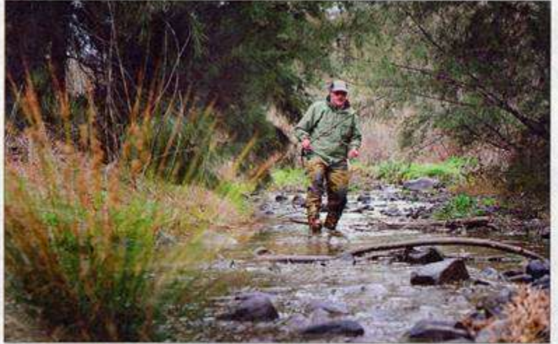
Focus: Fly fishing in the Murrumbidgee River at Uriarra Crossing.

desire to get his name on one of the trophies.