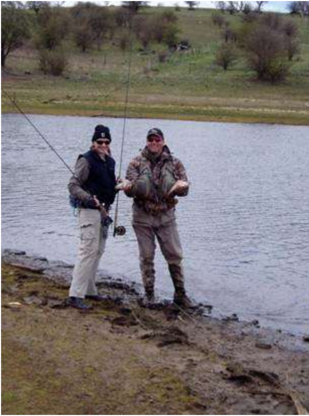
Some other shots from Ian, unnamed subjects.