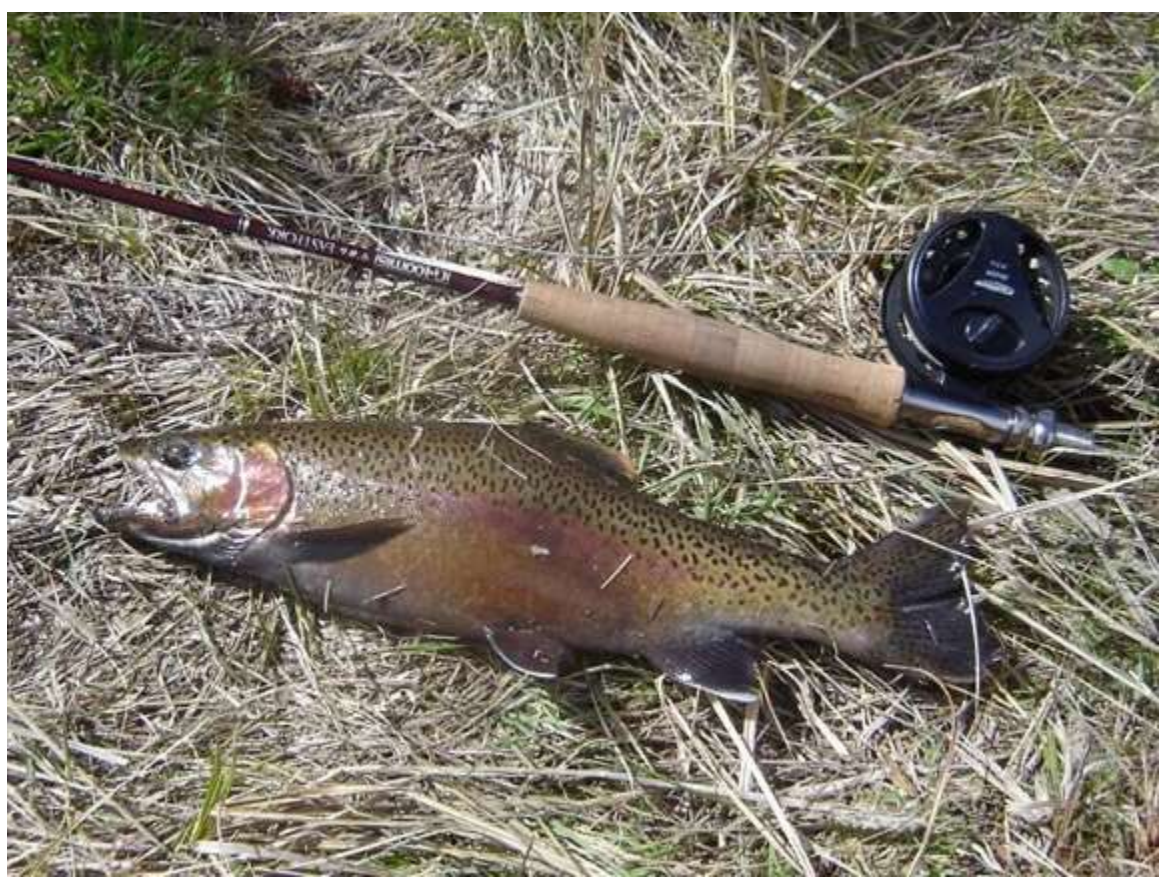
One of Ian's fish.