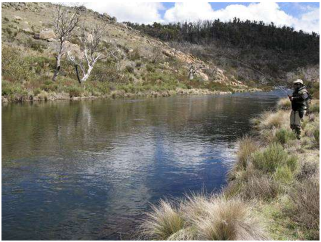
Alan on again – note the slower water but also the size of the river.