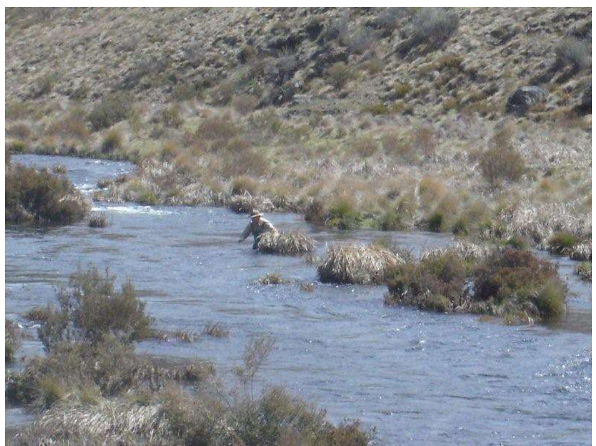
Bill retrieving one of his 'secret flies' – little help that they were on the day – next photos shows one of the four on but none landed!