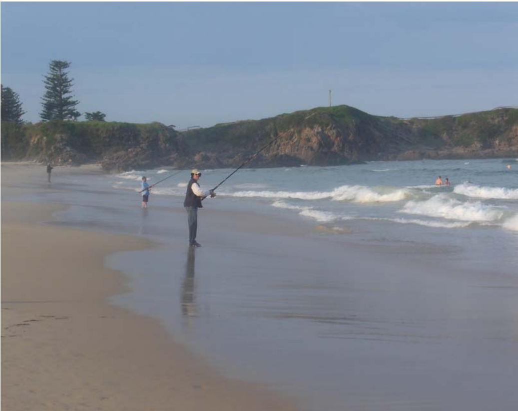
This photo shows Owen in the foreground, with Lyll and Alan acting as “flags,” ie people wanted to swim between them.