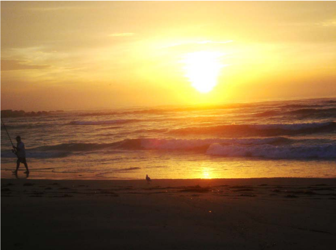
A spectacular sunrise greeted us on both mornings.