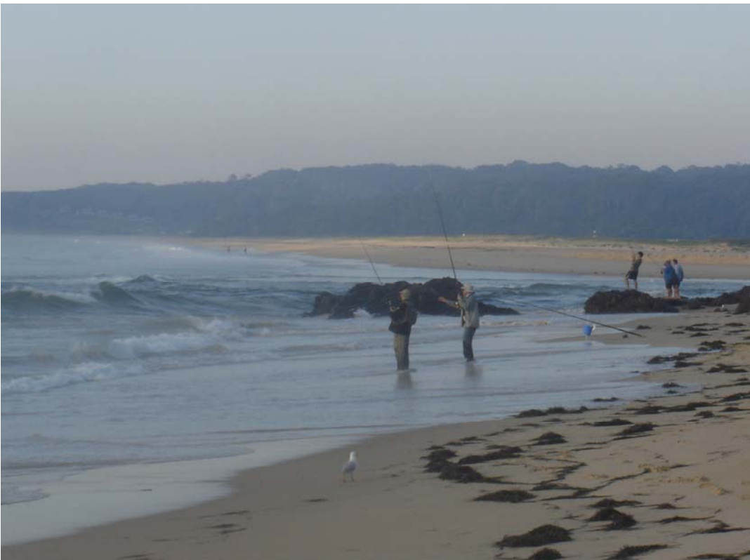
Most fishing took place on the beach where the Lake enters the sea.