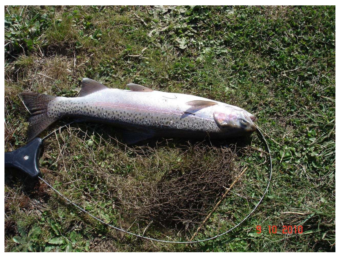
Bo1st was a 41cm rainbow taken in the big hole just below the Providence lodge.

Hi Bill .. a couple of photos from the Lyle Knowles day on Eucumbene River.