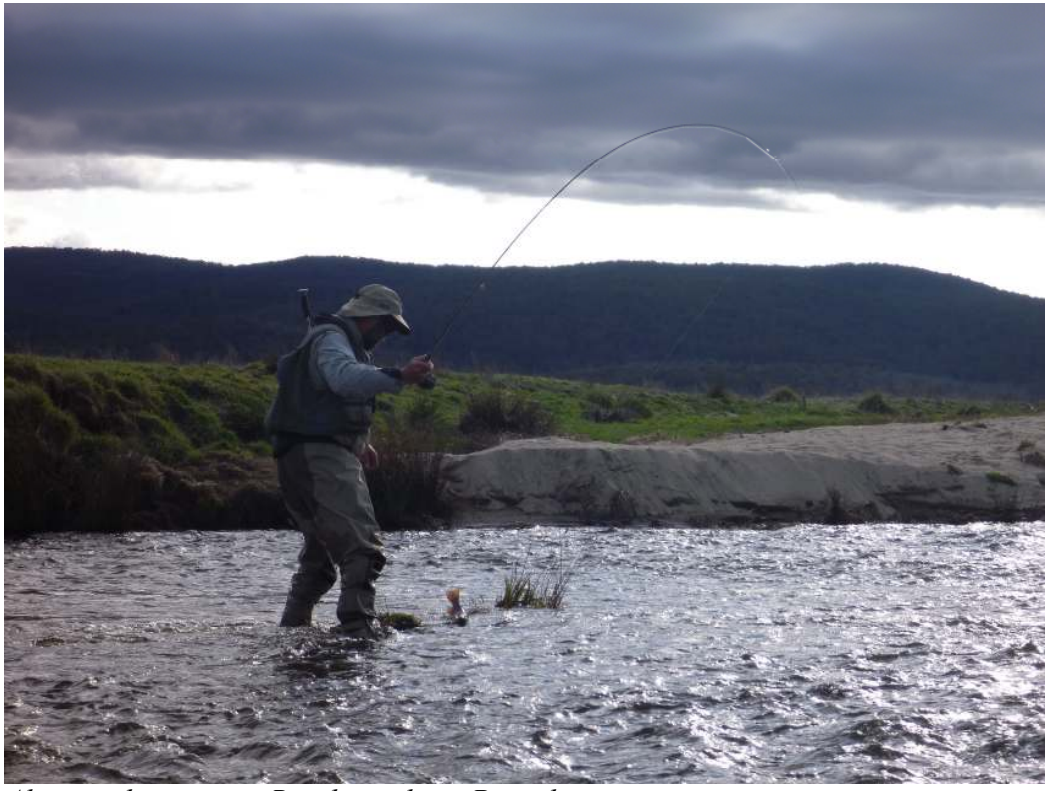
Alan catching a nice Rainbow above Providence