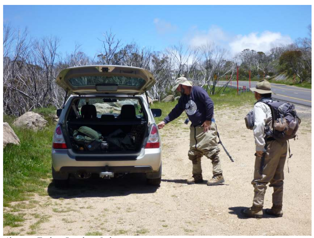
About to Trek to Rainbow Lake