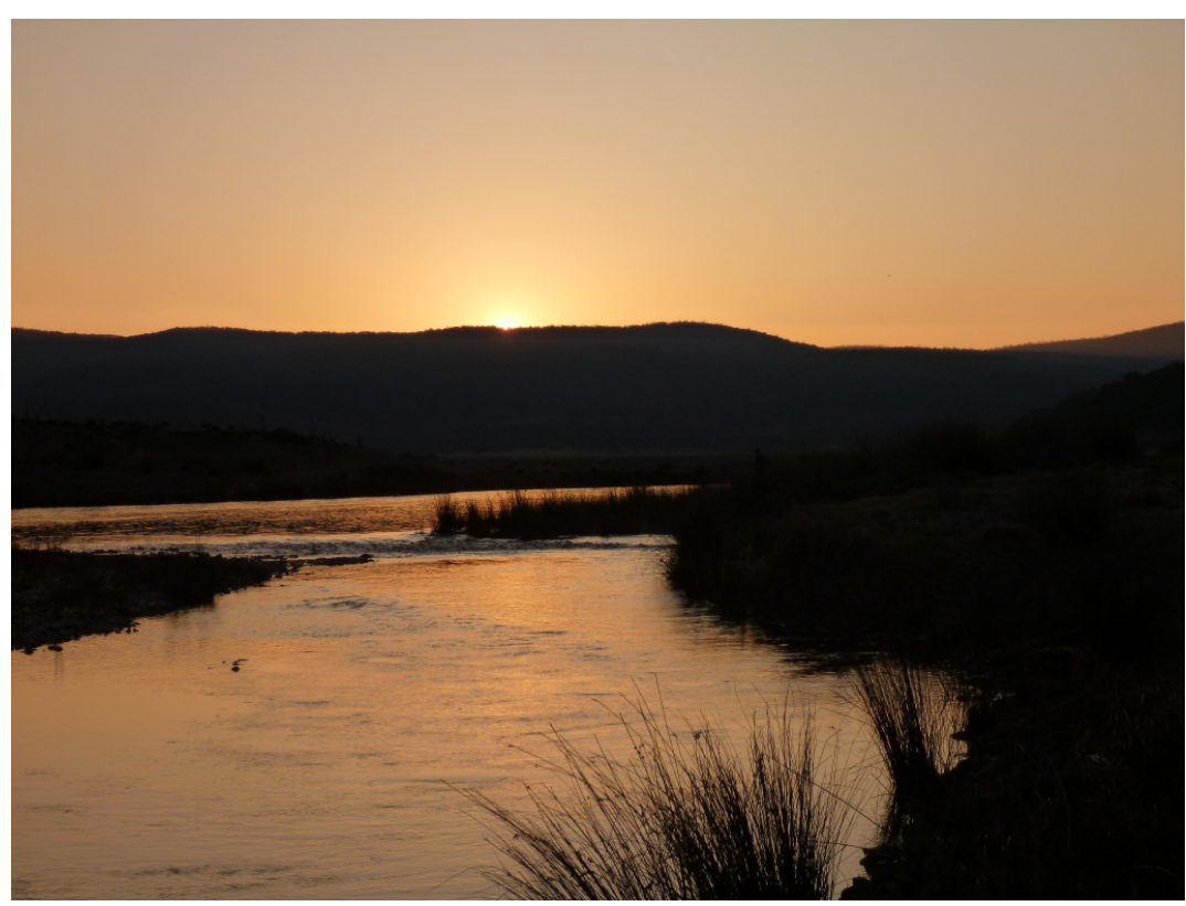
Owen is out there somewhere making a last cast