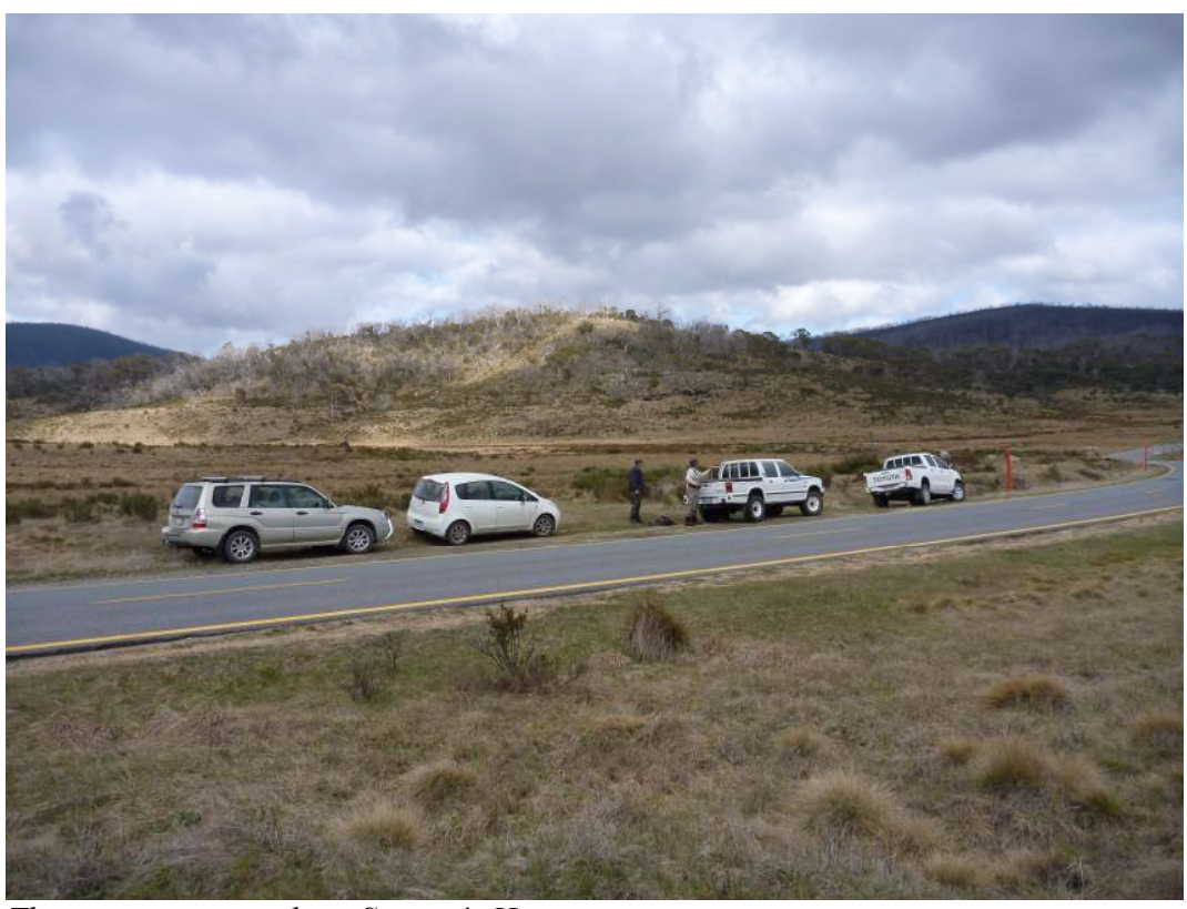
The convoy approaching Sawyer's Hut