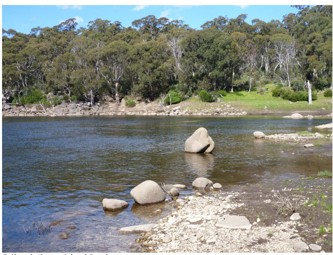
Bill and Alan at Island Bend