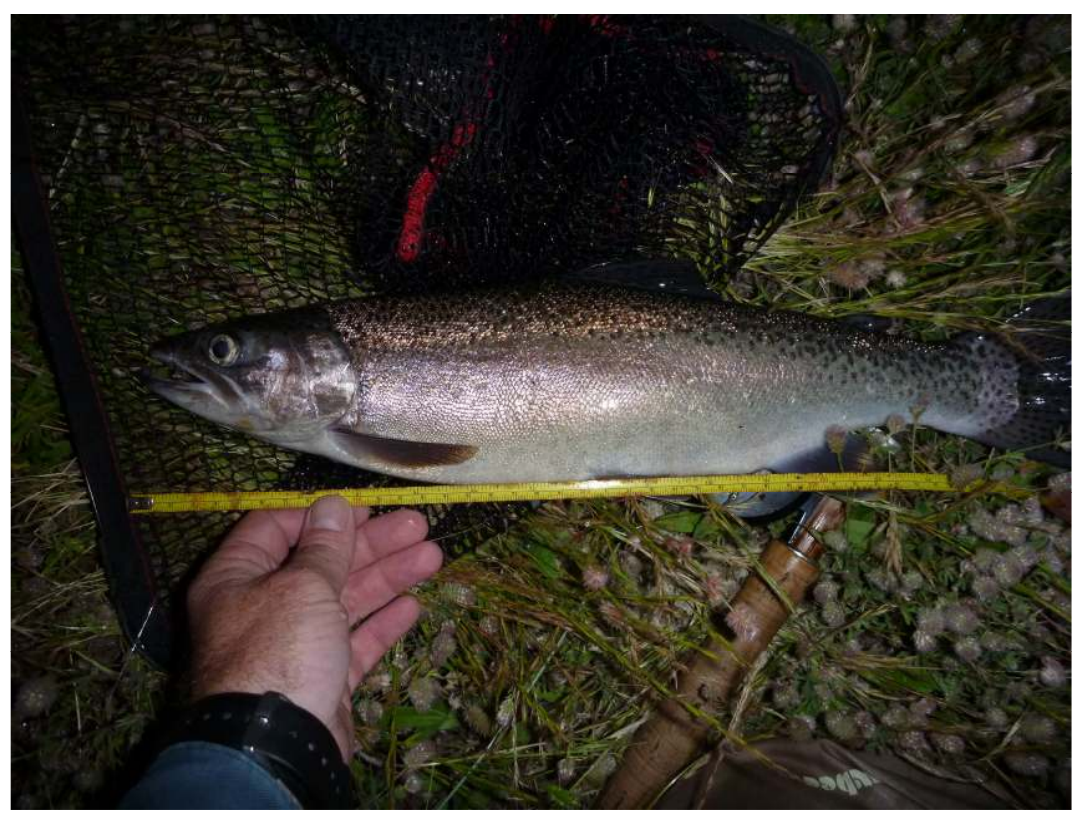
Lyall's Hayshed Rainbow