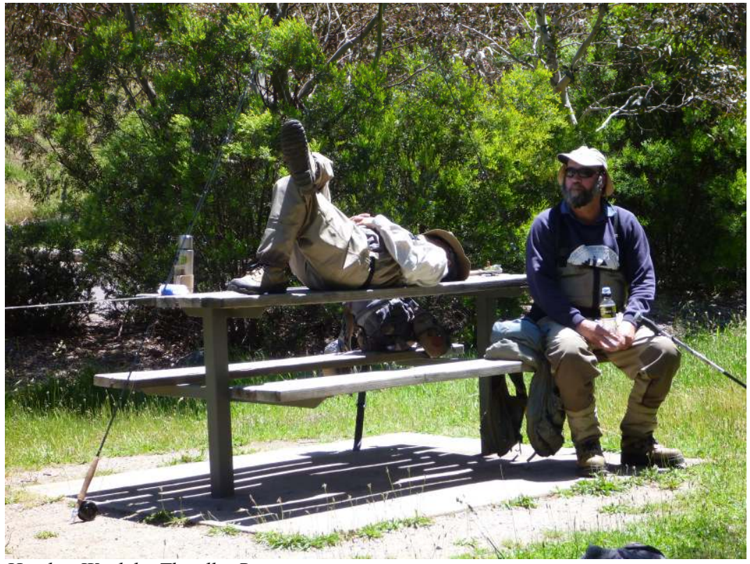
Hard at Work by Thredbo River