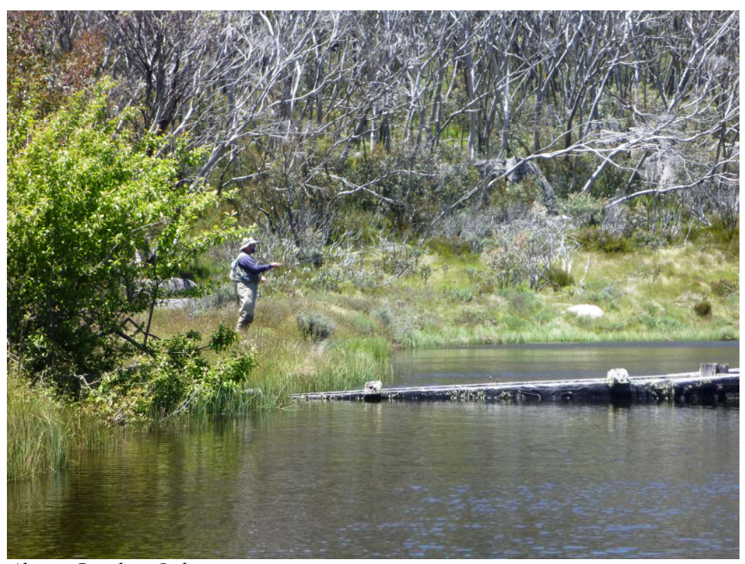
Alan at Rainbow Lake