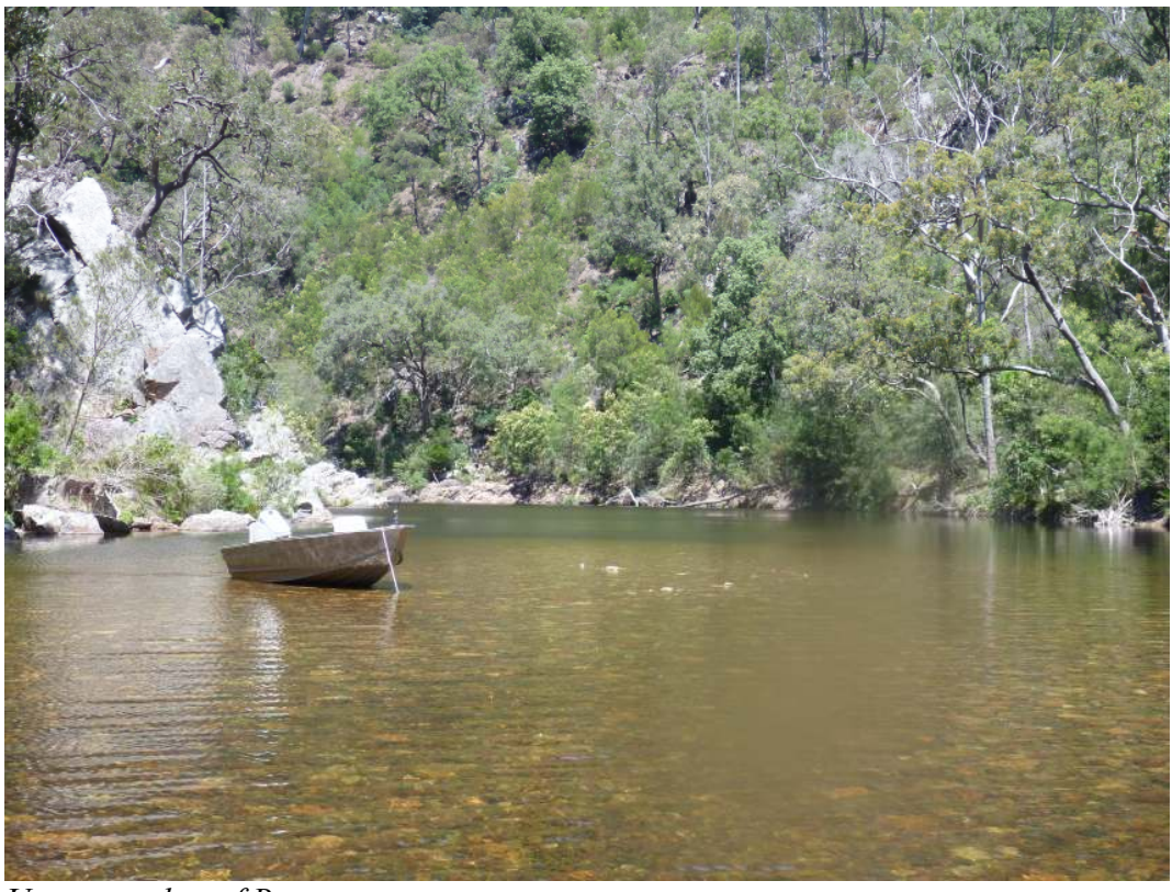
Upper reaches of Brogo