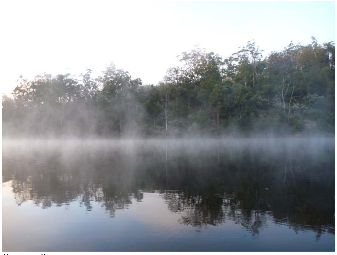
Dawn on Brogo

I have attached a few photos of the Brogo outing.