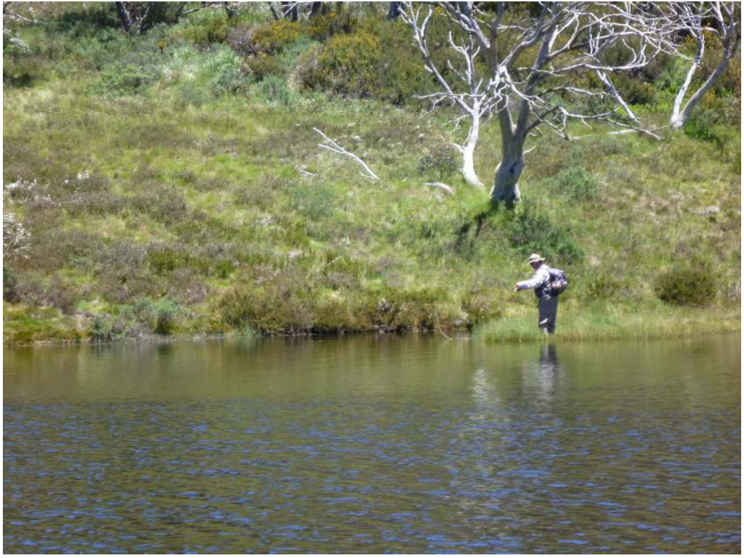
Bill at Rainbow Lake