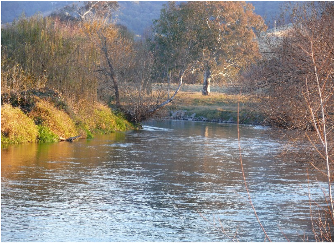
Dusk on the Tumut