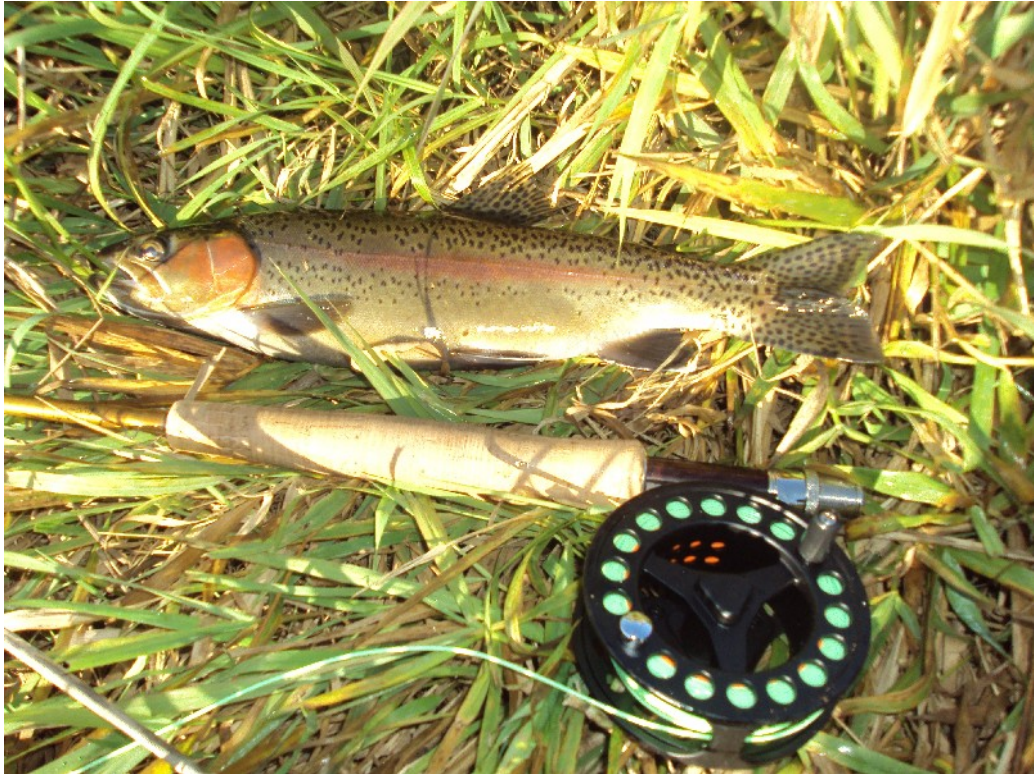
Steve's beautifully coloured rainbow caught on woolly bugger on the rise at end of downstream swing (?34 cm?)