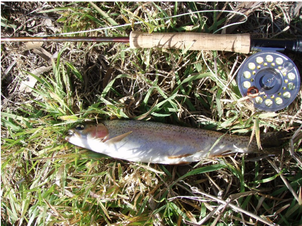
this prompted Bill B to try some 'down and across' with woolly bugger (32 cm)