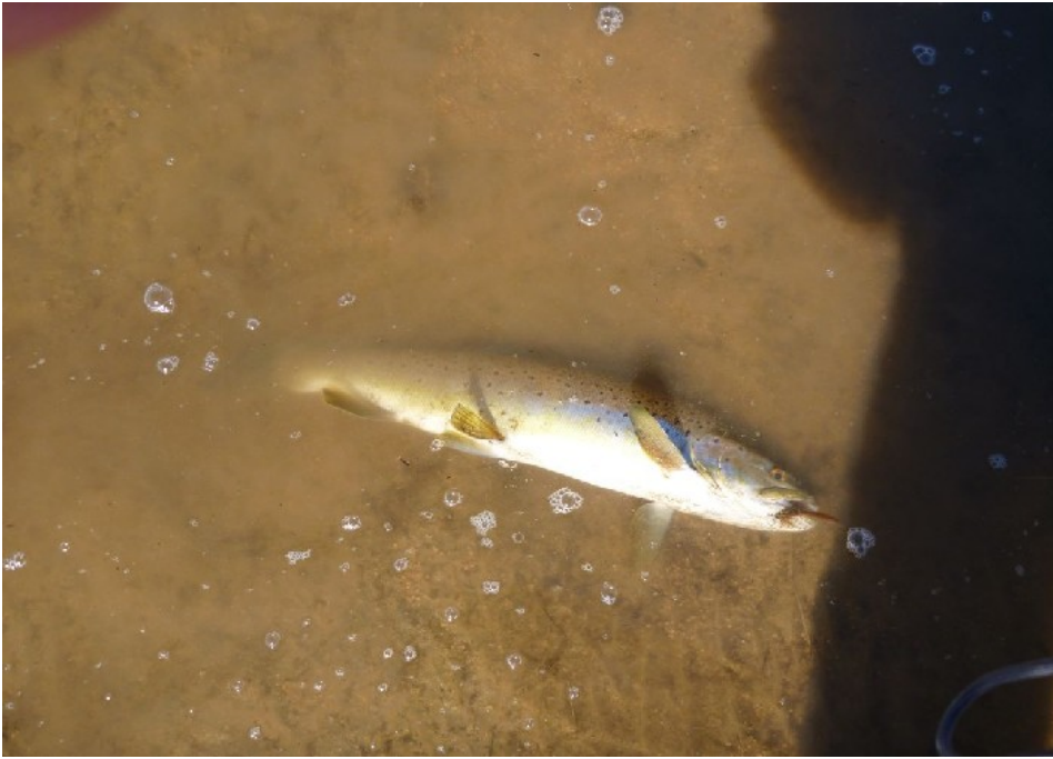
55cm Atlantic Salmon