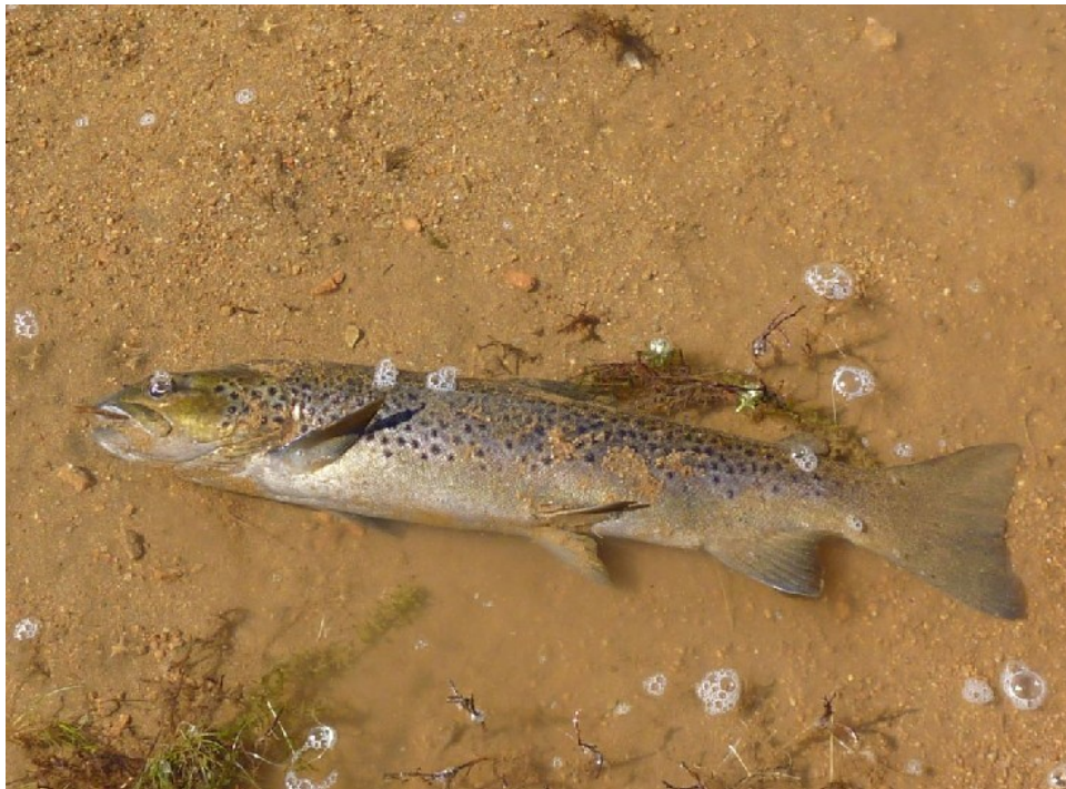
53 cm brown