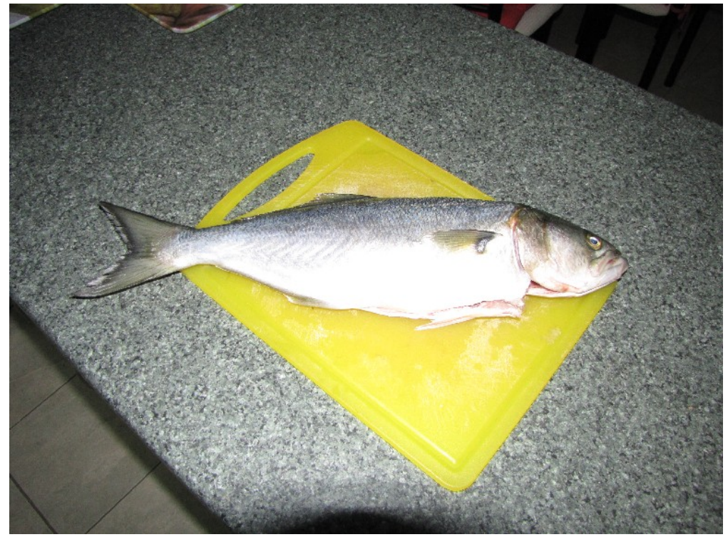
Owen's Tuross 52cm Tailor on the slab