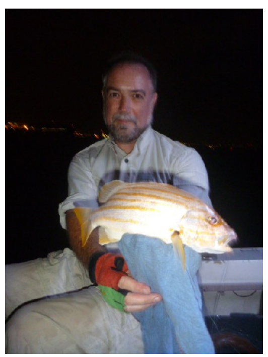
An un-named fisherman with the lights of parked super tankers in the background