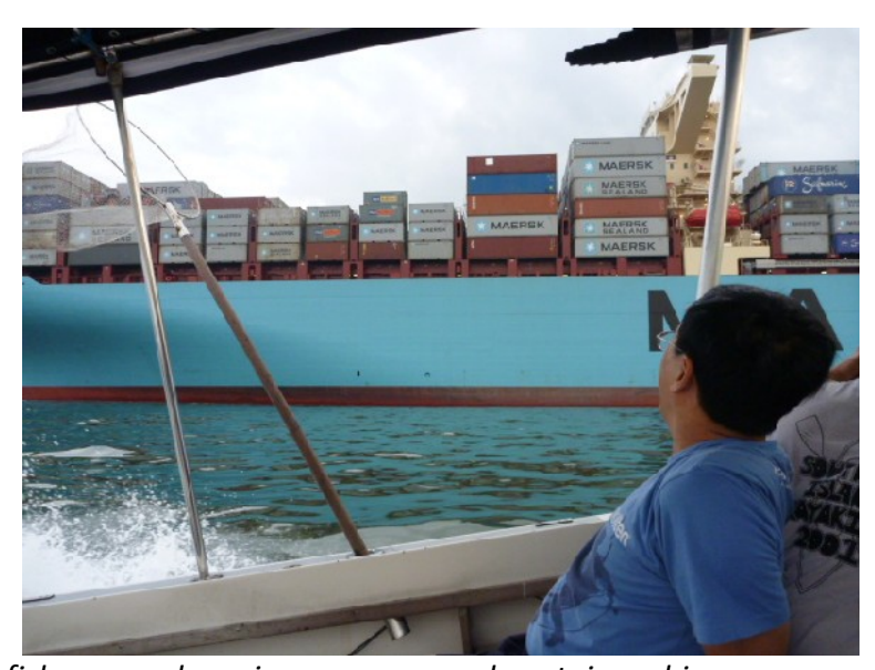
An un-named fisherman observing an un-named container ship