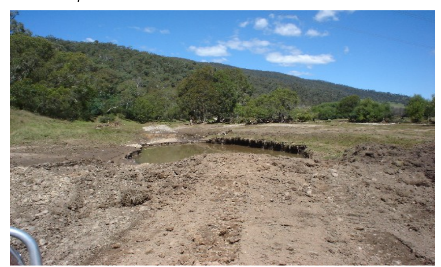
The Brindabella Valley Road at Camping Area