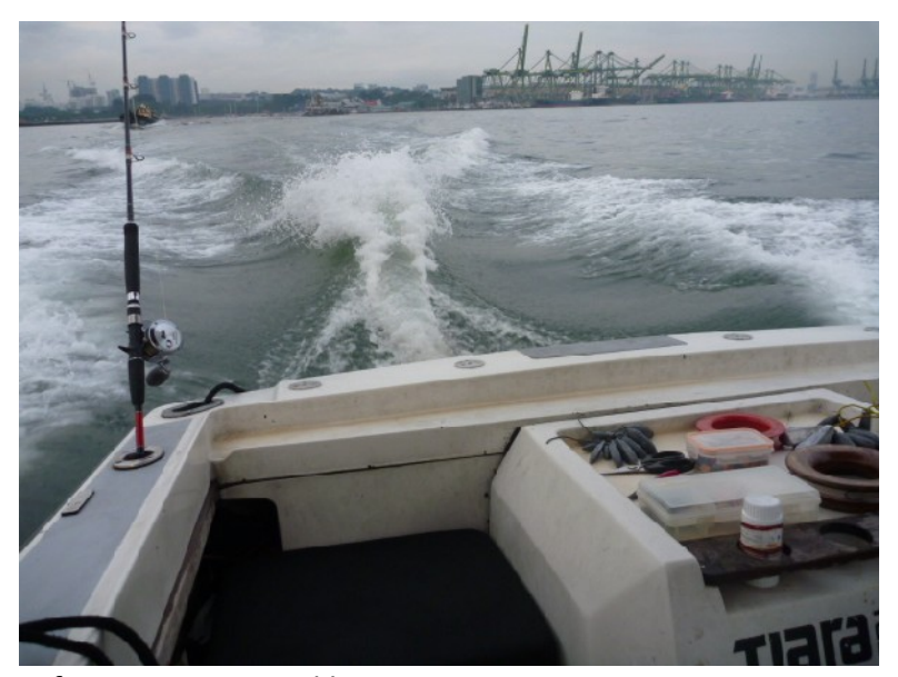
Dusk. Departing from an un-named location in Singapore