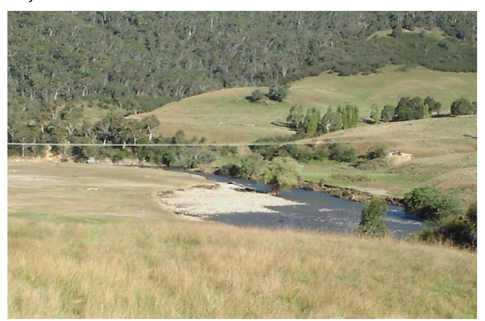
similar outlook with so many of the willows gone