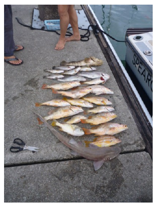
The night's catch on an un-named berth at 08.00