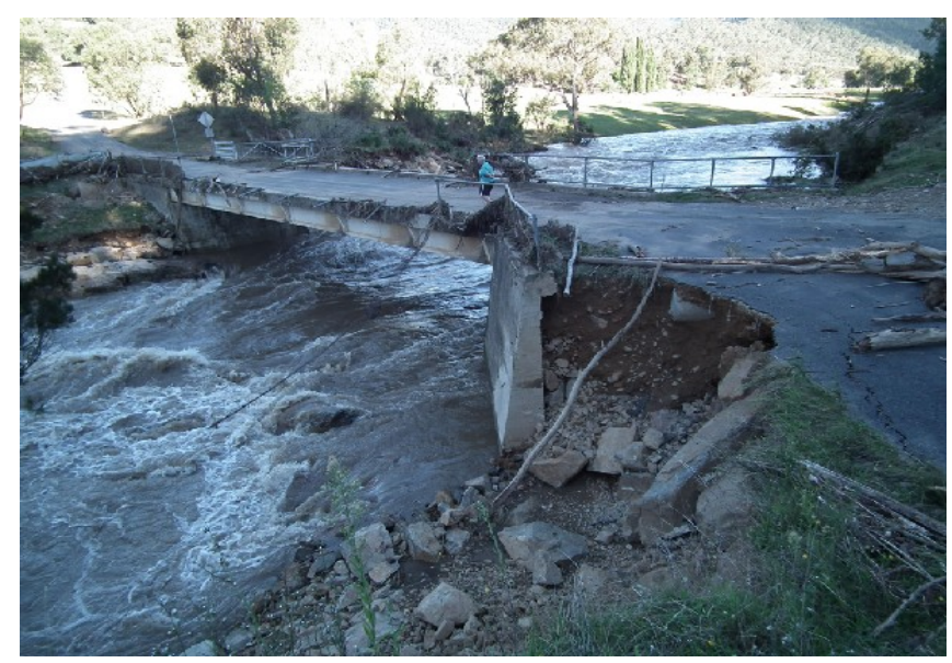
Bridge after some drop in river level