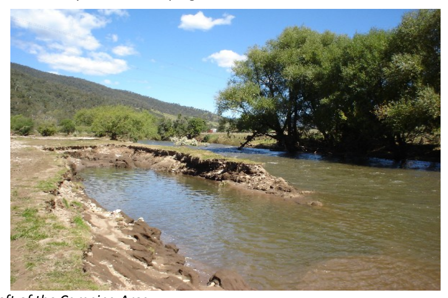
What's Left of the Camping Area