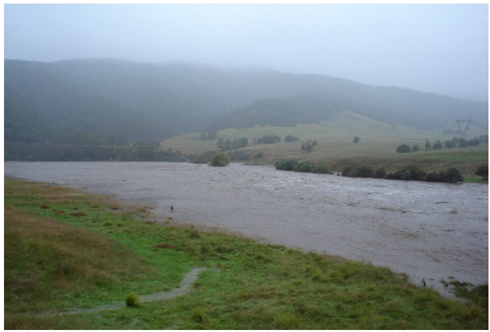
the river in flood below the windmill