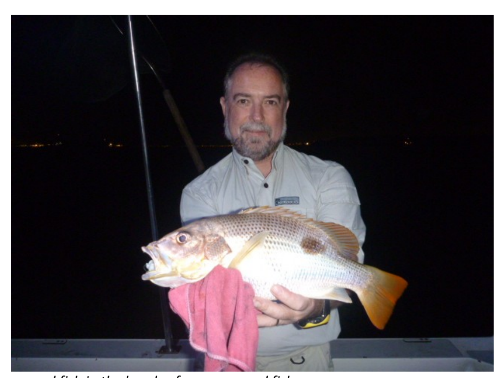
An un-named fish in the hands of an un-named fisherman