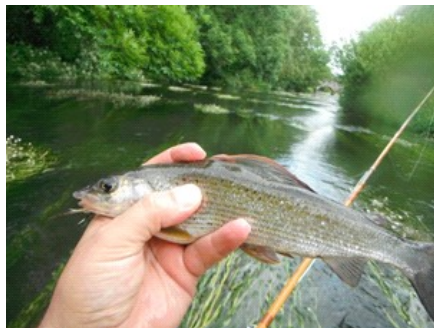
A nice grayling on the local fly, caught behind the weed channel in the bright reflection towards the bridge arch

Turning around and casting downstream, I was aided being a left-hander, and able to keep a little more tension on my fly as it drifted down the gullies between the weeds. I was also able to more naturally dip and lift the fly like the mayflies were doing. Missing the first couple, I managed to hook a nice brown trout about 4pm. I like to think it was the same one I'd seen hiding behind the tree by the stairs, which although he had looked at my flies a few times casting upstream (including my CDC Greendrake), had passed them up. I debated about keeping the trout, but recalling the publican and his family weren't that keen on trout (and not fishermen), I returned it for another day, and after a few more casts, headed in for dinner and meeting some others in the pub.