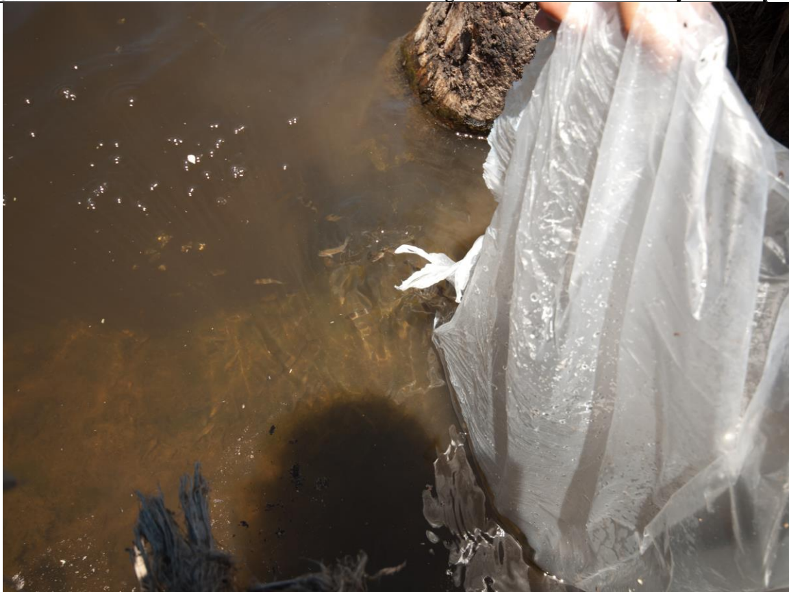
Already heading to the snags