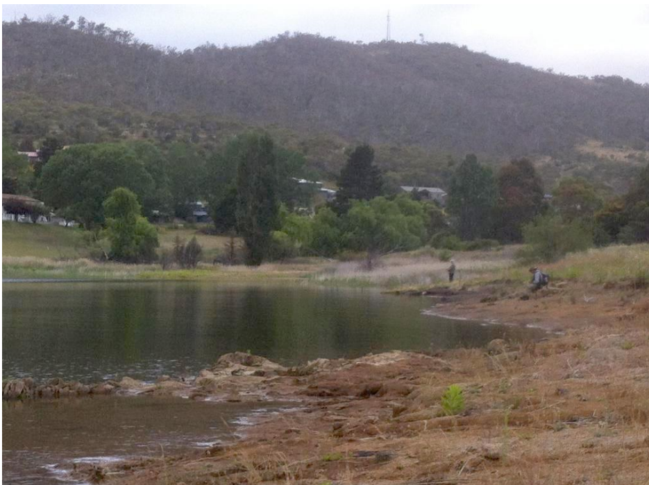
Dusk on the shore, lodge is just out of frame to left