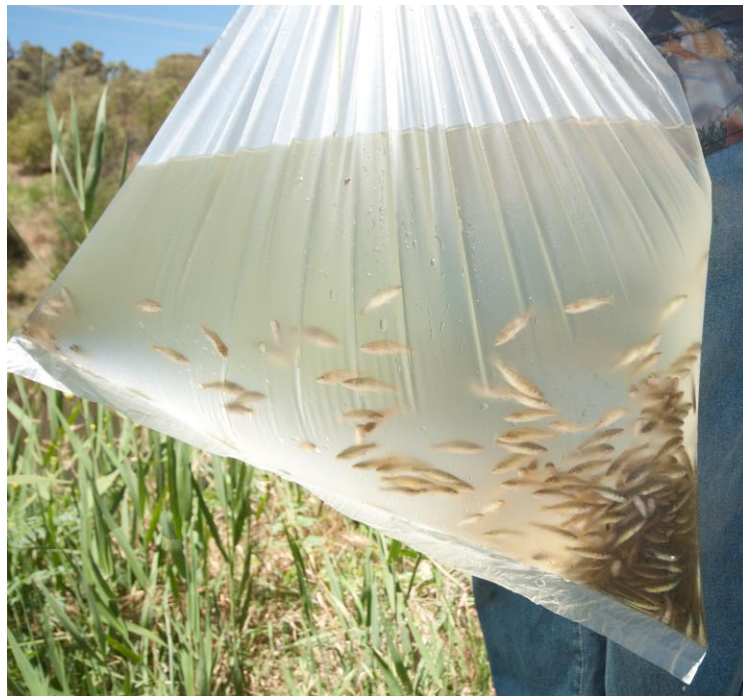
Ready to pass down to the river's edge