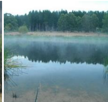
Bondi Forest Lodge and lake by moonlight, and in the morning with Skippy for breaky and hoping for a dry fly take

Despite a nice moon rise over the water about 10:30pm, it was pretty quiet (and a bit chilly on the bare feet) but a pleasant pre-bed flick, and after short nap soon the race was on to the water pre-dawn – at least until a little boy woke up. After a break for breaky (and a short wade to retrieve some flies and leaders from the reeds), the flogging resumed. Alan was just re-entering the dam when a summons for the larger landing net was again issued, as a rainbow had decided Jason's wooly bugger was a nice snack. A nice 47cm trout was landed – probably also christening my Lamson reel and frequent flyer rod - timed nicely before the next call to action for Dad and the toilet training.