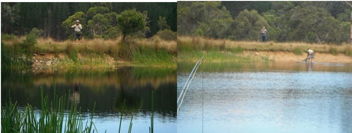
Giving it a good go, and the “other” anglers land a fish

Mid afternoon found us all trying our luck on the stocked dam near the lodge, and after a slow start a few small bow waves kept us going, until the other anglers landed a nice trout that had some trouble fitting in the landing net. We noted the Loop nets were probably going to be a bit small with that fish appearing to be at least 60cm, but fortunately we had a larger folding net.