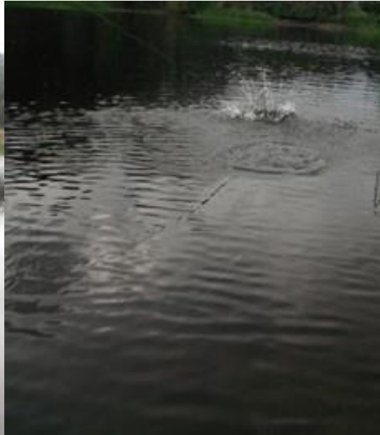
Alan's fish – playing, acrobatics