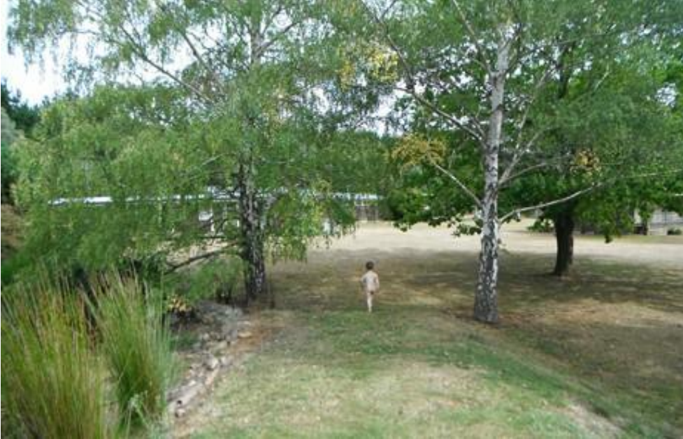
The lodge has a relaxed dress code for the trip from the dam to the lodge

Although the dam was given another good working, and a nice 14” rainbow was spotted nearby chasing mudeyes, no more fish were landed (despite Luke’s best slow and steady retrieves). Alan had to return to Canberra for work on Monday, and an explore out to Craigie and Qinburrah Rd showed some potential for river fishing in skinny water (reportedly some small grasshoppers are about), but the dam was hard to pass up with easy access, clear backcasts (mostly), and good-sized fish. A brief afternoon thunderstorm stirred the action a little, but not quite enough to convert it to a fish – at least not when being called away to assist a young chap (or save the chickens from a wannabe farm hand).