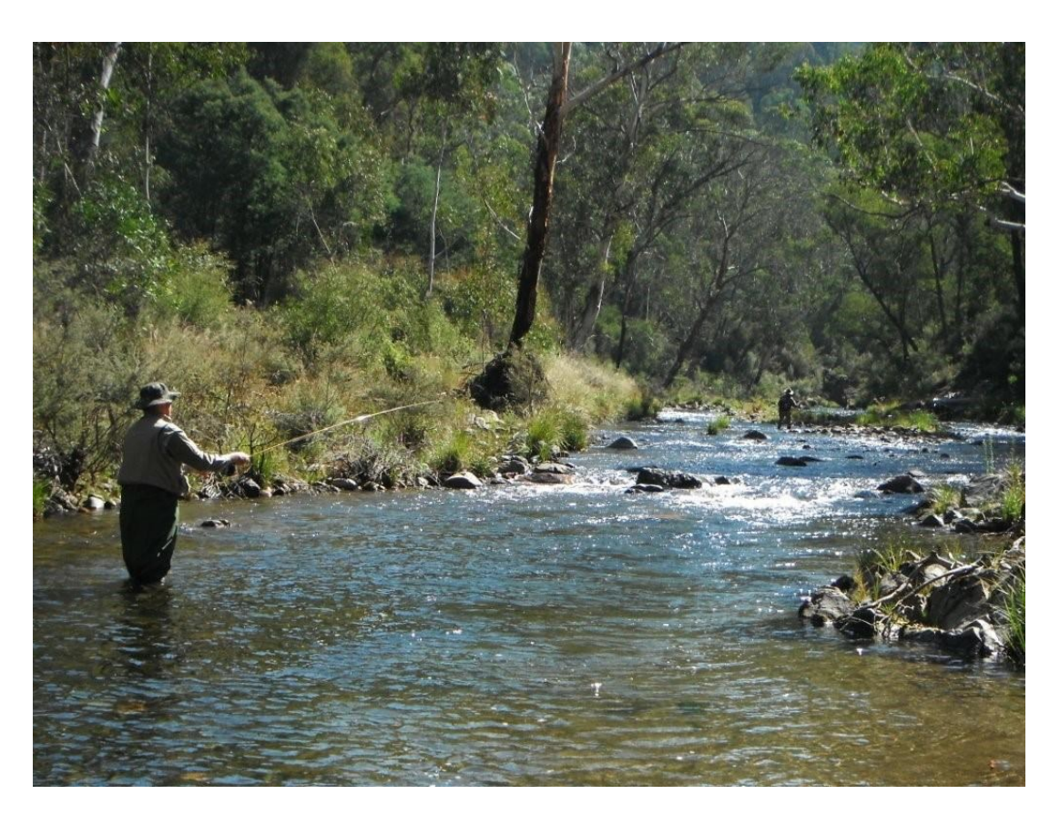
Greg W and Bill B—on a river somewhere!