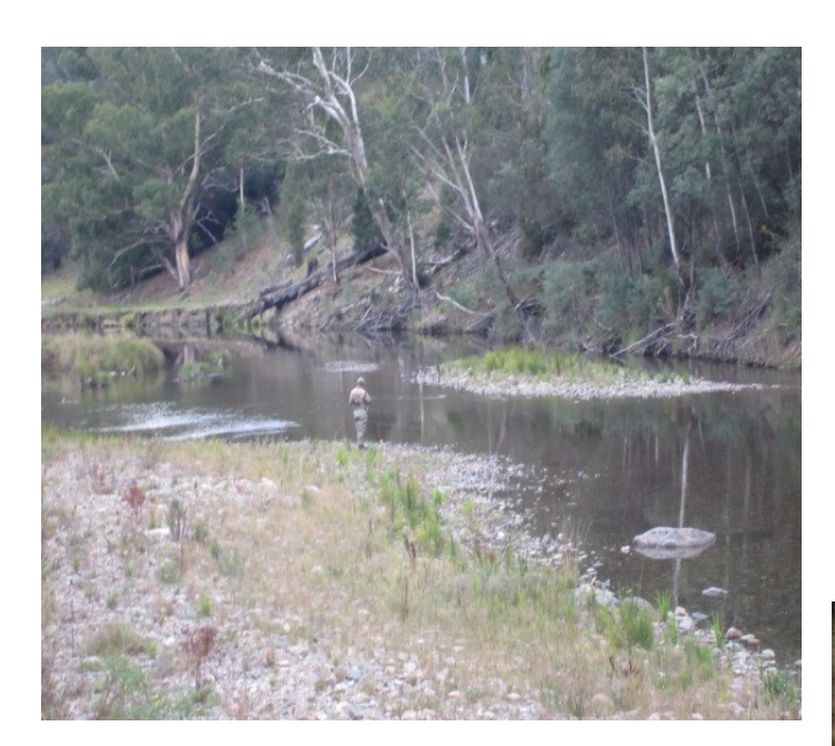
Lyall, found that solitary fishing on quiet river most enjoyable