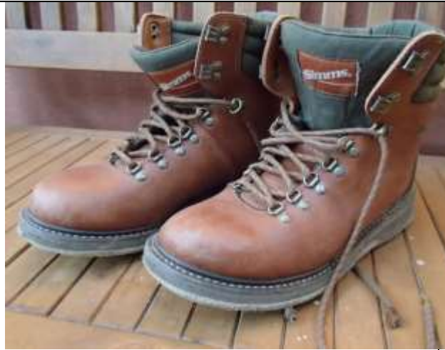
Simms 10, felt sole. $25

“My father-in-law's gear, very good condition”