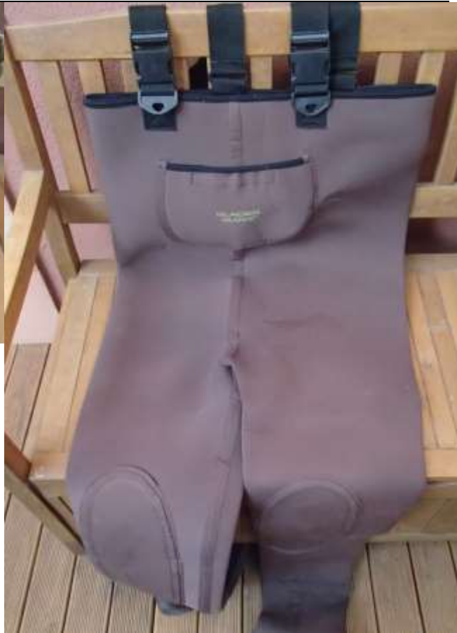
Glacier Glove, large. $25

Any fishing related items that members would like to advertise here, please email newsletter@canberra-anglers.asn.au .