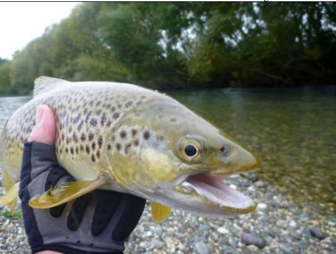
Ian channelling Jason Q's photography