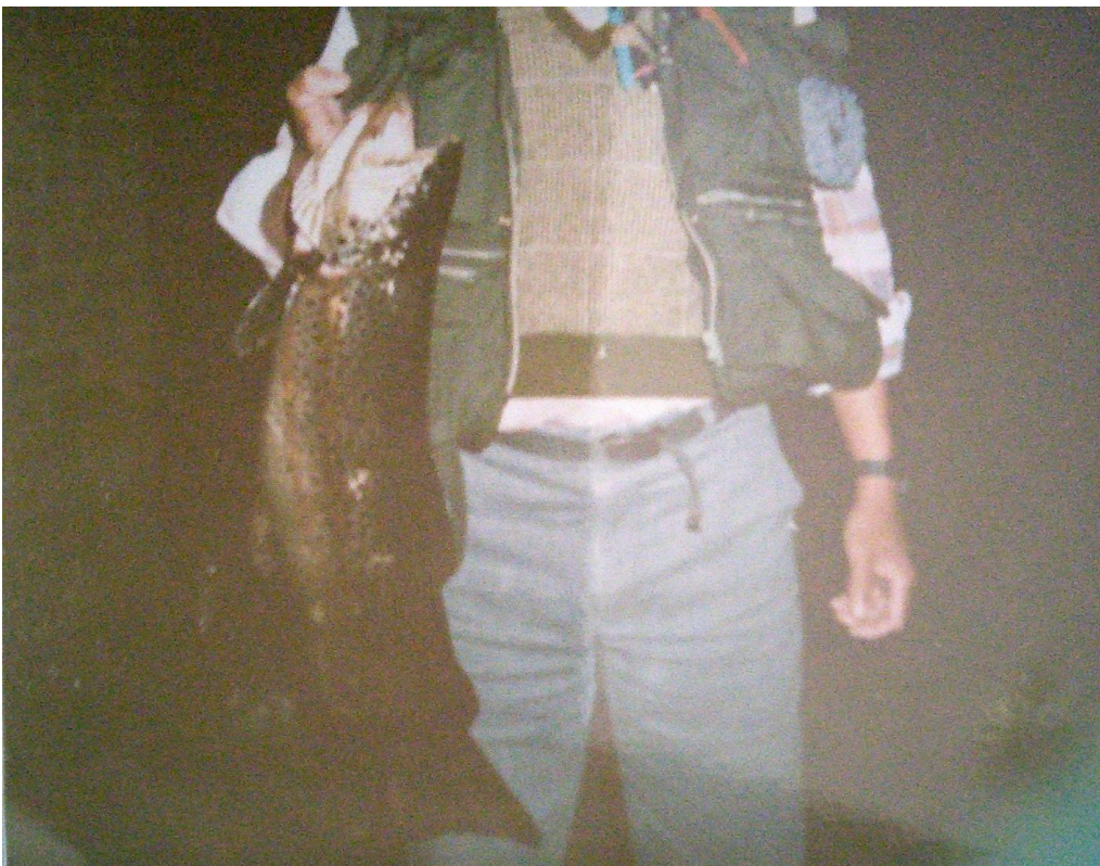
One warm dusk in November – a beetle feeder that fell for a beetle fly from Lake Eucumbene