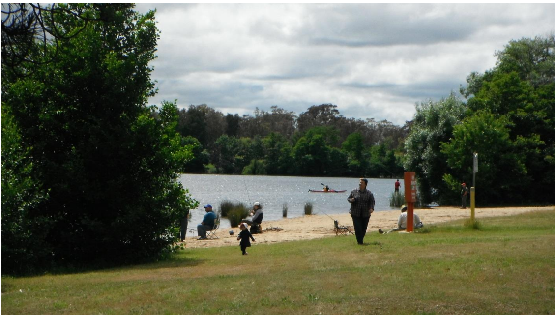
Fishers on the beach