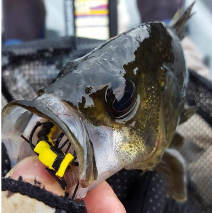
A hungry Brogo Australian Bass fell for Steve M's foam fly

In This Issue (clickable links to jump straight to the segment):