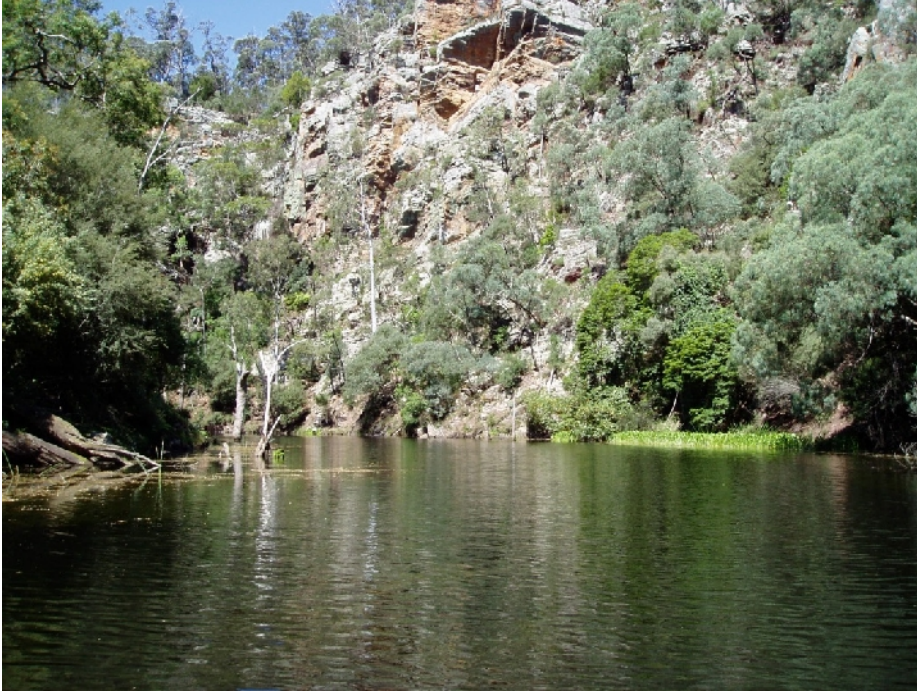
A few scenic shots.