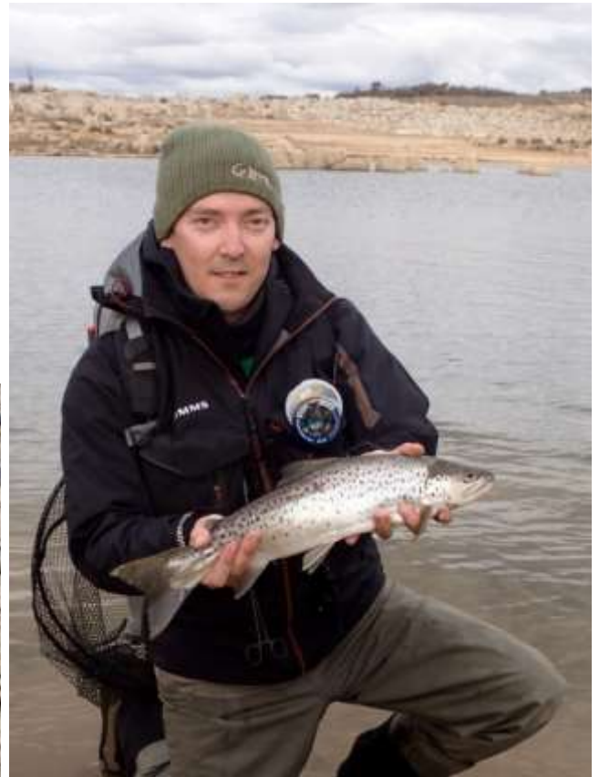
After the buttery trout at Bondi this looks almost like a sea-run