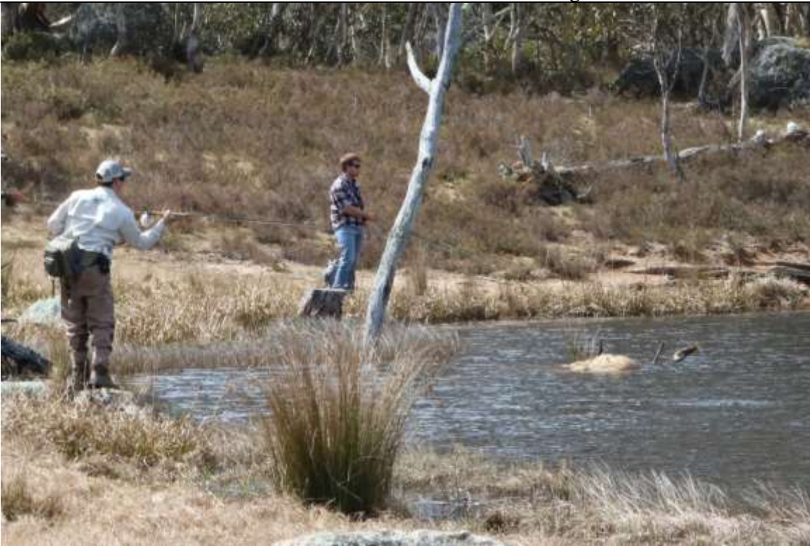
CCI qualified Nathan showing how to handle a jumping fish.

And then to hand to prove to the others on the top lake that there were fish in the water.