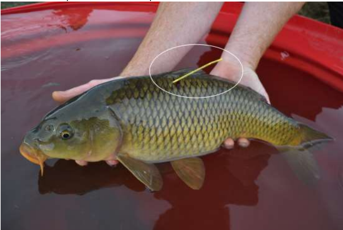
Carp with yellow tag. This is a research fish, please release if caught.

Information about when and where carp move will be used to inform future trapping programs. If you would like to assist with the Carp trapping program, please contact Antia on 0429 778 633 if you would like to help.