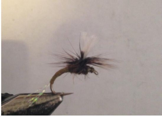
Klinkhammer style midge