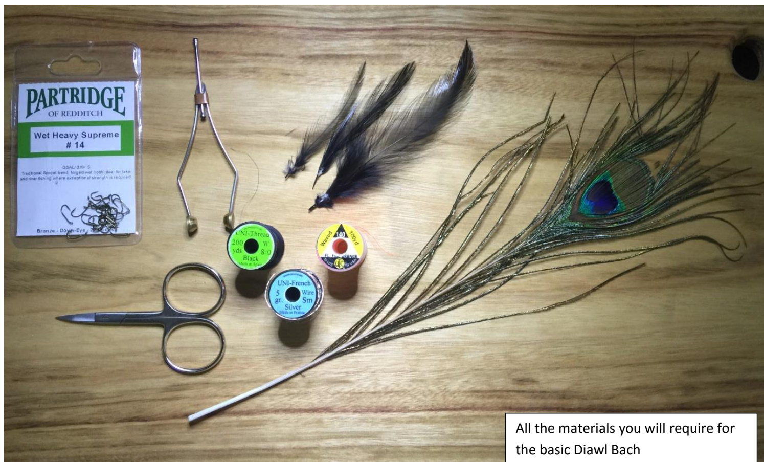
All the materials you will require for the basic Diawl Bach