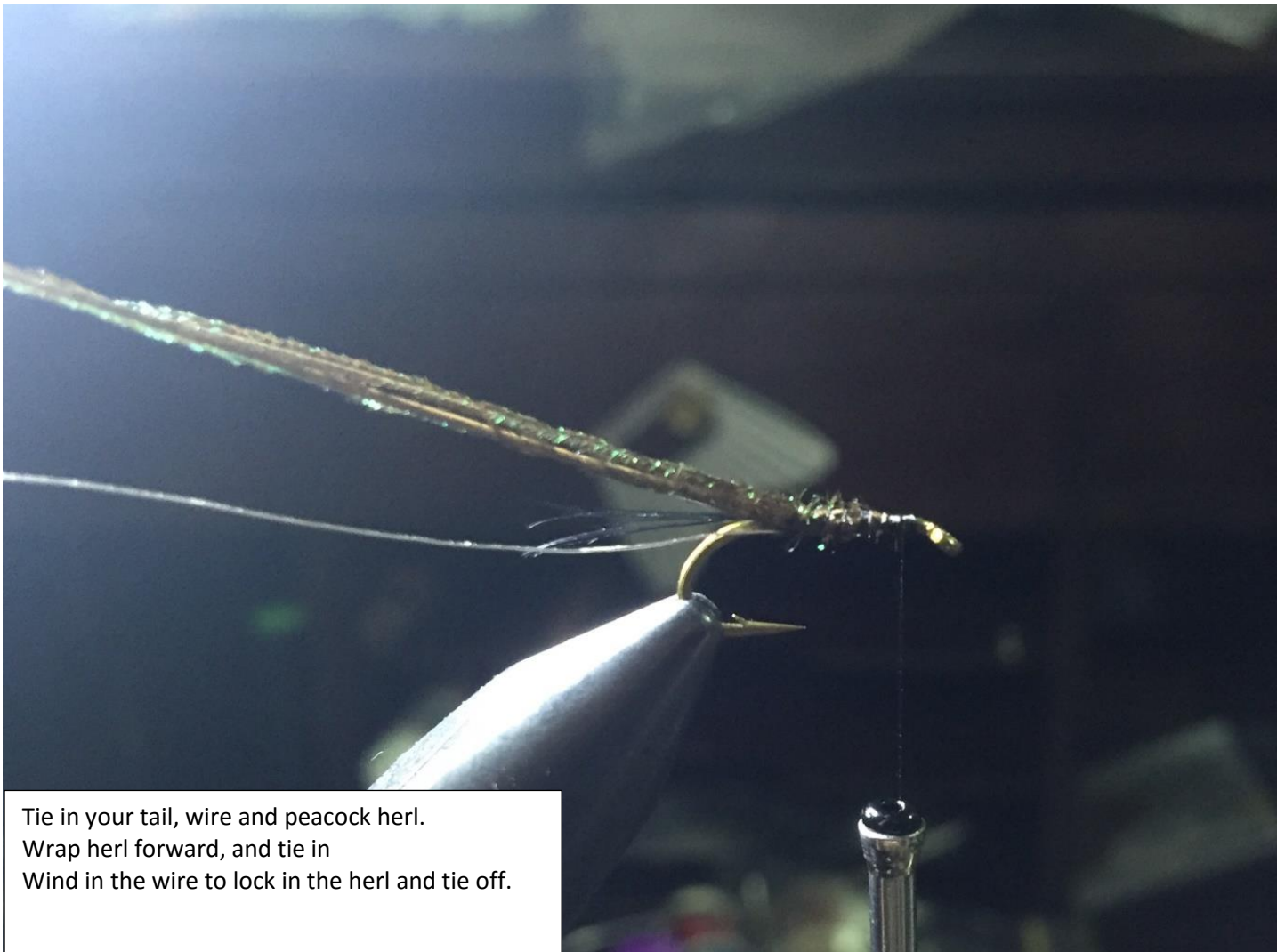
Tie in your tail, wire and peacock herl. Wrap herl forward, and tie in Wind in the wire to lock in the herl and tie off.