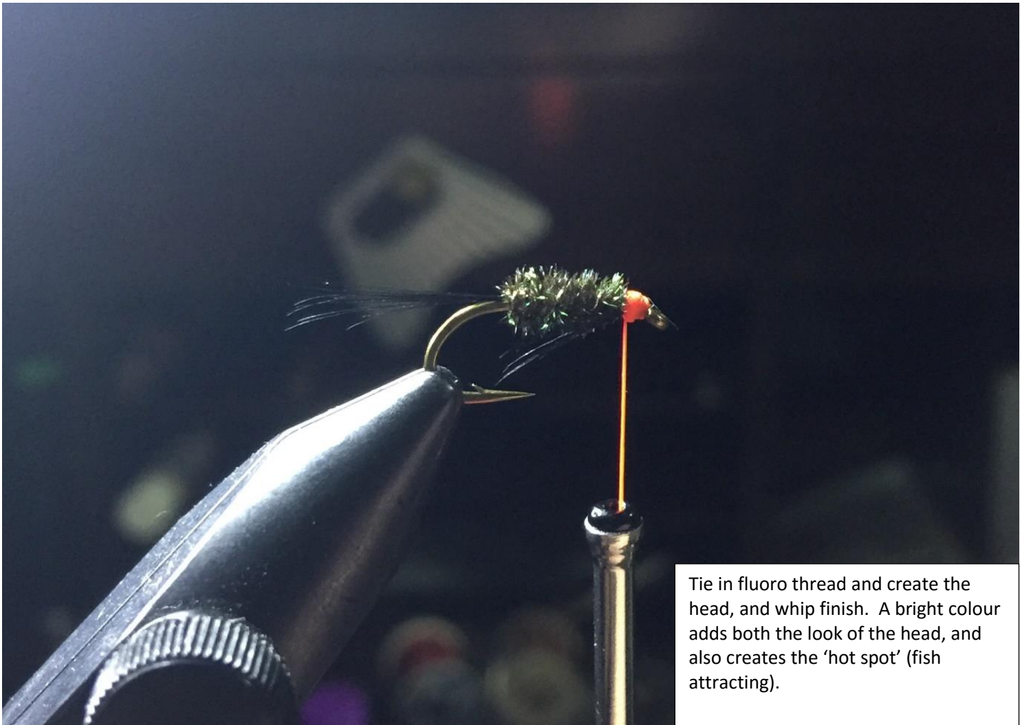
Tie in fluoro thread and create the head, and whip finish. A bright colour adds both the look of the head, and also creates the 'hot spot' (fish attracting).