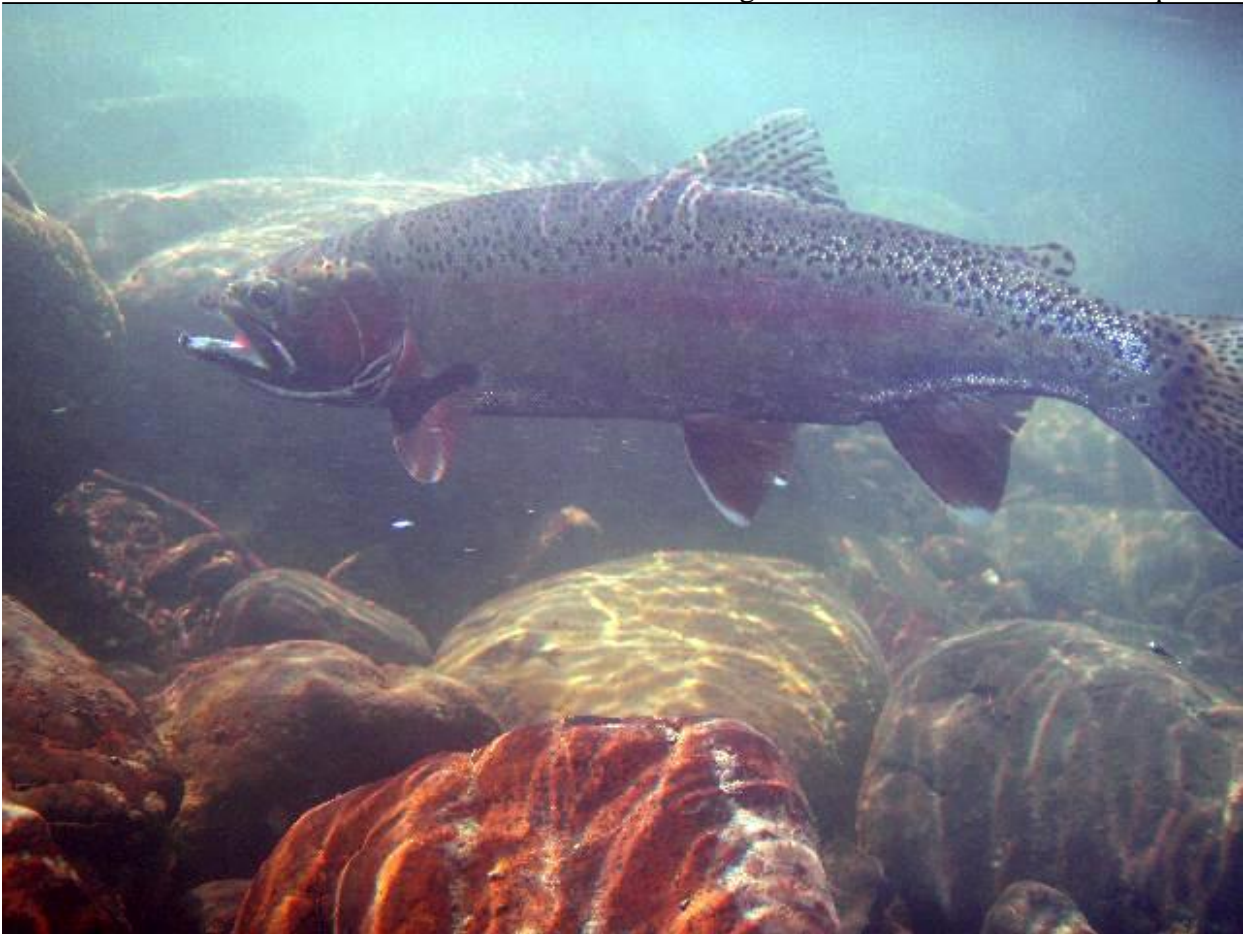
(Eucumbene Rainbow – glowbug with trailing bomb visible. By Bill)