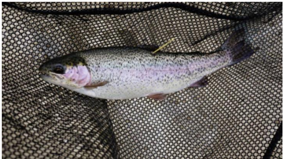
Advice from Steve was that the fish were 20cm when they were tagged and likely had grown out to 21cm by the time they were stocked.