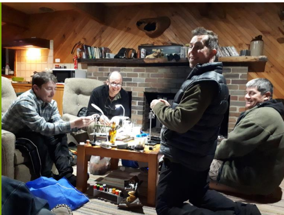
All smiles from our recent Bondi Forest outing. Trip report on the following pages.