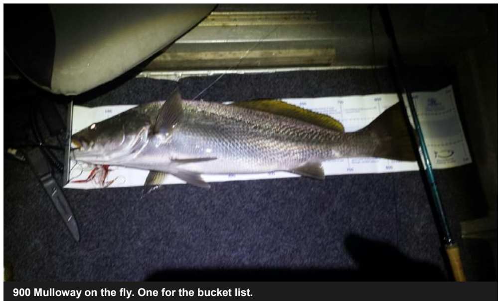
900 Mulloway on the fly. One for the bucket list.