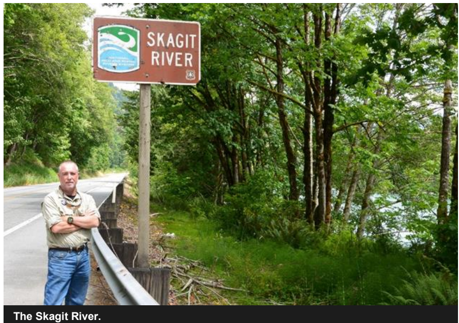
The Skagit River.

A. "Why the Skagit River in Washington State of course 'yo 'lil Aussie woot woot !!!"