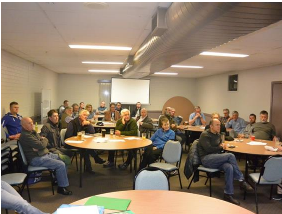
A great turnout for our Annual General Meeting.