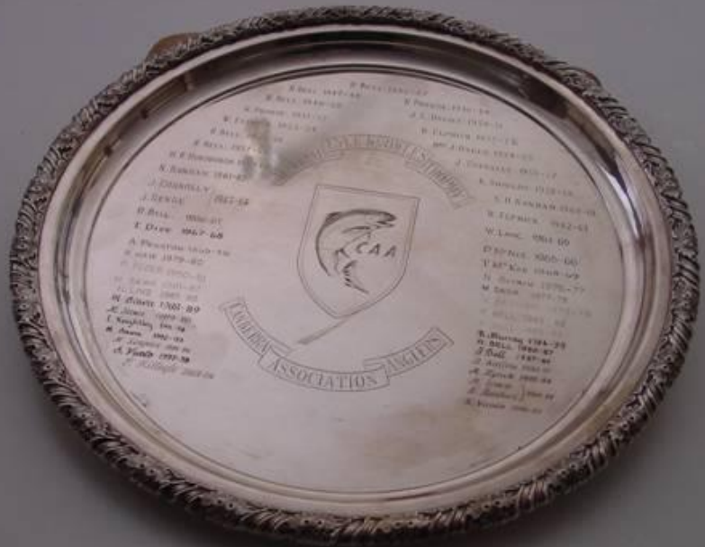
This historic Lyle Knowles trophy is up for grabs at our outing on October 21. It is a silver platter which dates back to the start of our club in 1945.