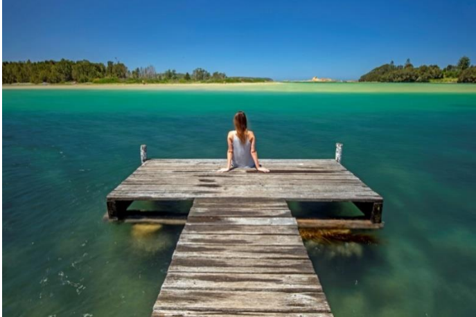
Tomaga River

A new approach to managing NSW marine parks has begun with a pilot project underway in Batemans Marine Park. A new management plan is being developed to replace existing arrangements in Batemans Marine Park and for the first time will take into account the environmental, social, cultural and economic values to be conserved by the marine park, as well as ways of addressing the threats to those values.