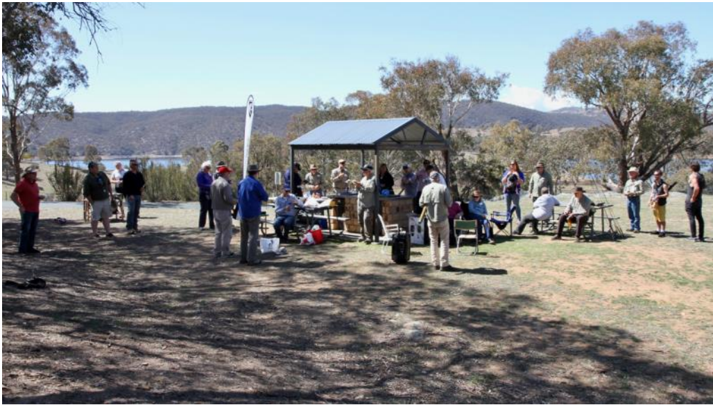
Fantastic turnout 3rd weekend casting— Googong NSW