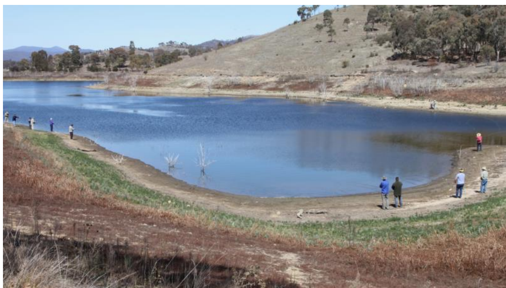
Googong and the many casters taking advantage of the sun and free tuition.