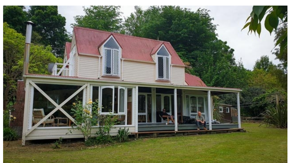
If you can get a vacancy, stay at the very relaxing Ruakituri Retreat