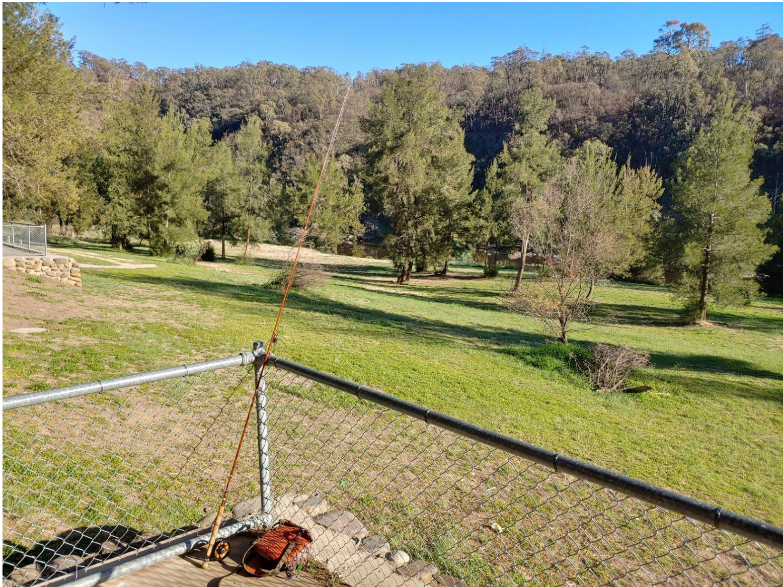
Hanging the rod up for a while