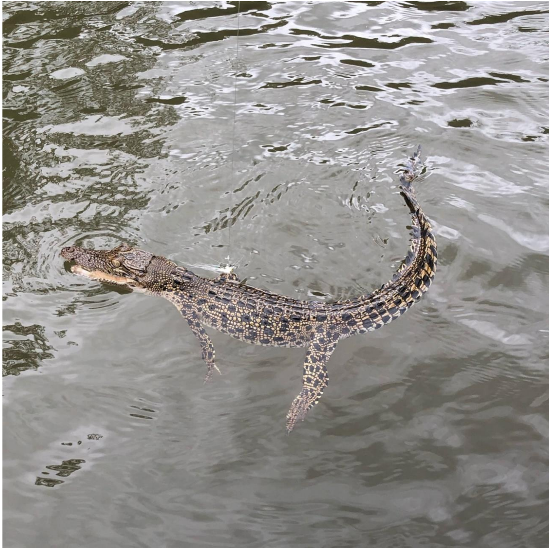
Not Quite What JQ Expected to Land