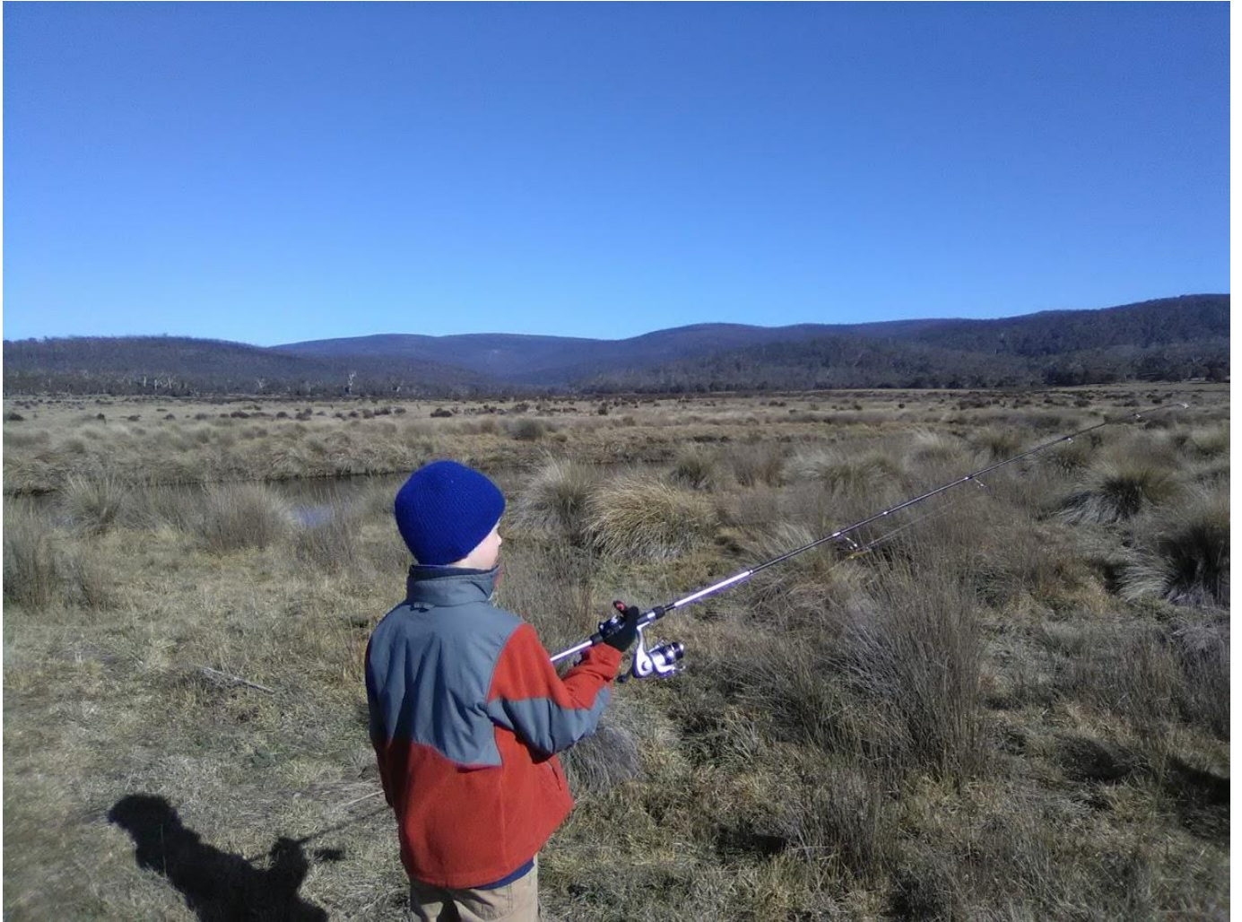
Luke Eyeing off the Late Season Eucumbene River