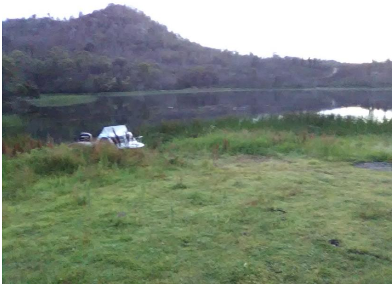
Brogo looking green in the morning

Heading back out the next morning, I decided to try a couple of different lures. Always a good place to be after a good session. I put on a deeper diver, and a shallower diver, to see how they went. The deeper only really hooked up on the weed, and eventually went to the lure gods (and replaced by a nice little lure I found in the landing area). I got a few more fish, including another 28cm one.