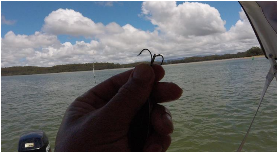
Treble bent on an Australian Salmon