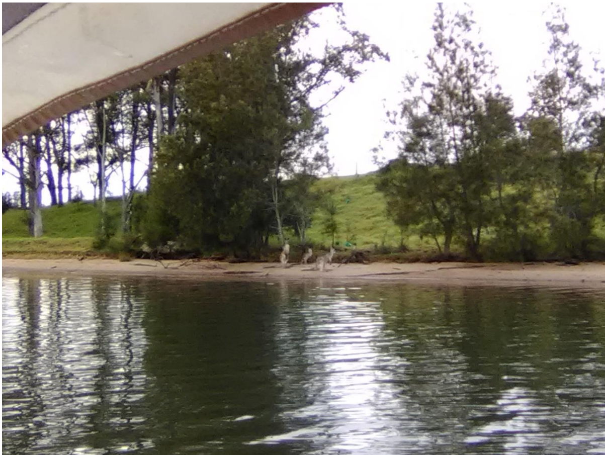
Fellow fishers enjoying breakfast...