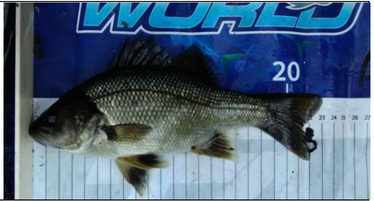
A couple more morning bass

I then brought the ute down to recover the boat, after boiling the billy and frying some breakfast about 10am. The sun was beating down, and I was contemplating a dunking afterwards to cool down. Coming down the hill, I saw a hatch happening, and fish slashing at them. I decided to take a short detour to recover the boat.