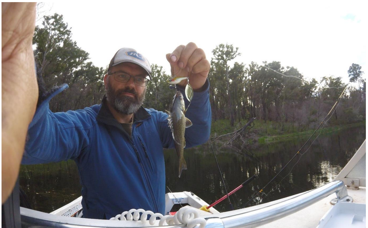
Success on a bladed vibe casting up near the snags

Whether it was the “flush” of dropping to 10% in January and then refilling overnight, or just more relaxed fishing than usual, it was a great session at Brogo. The usual 33-36cm fish weren’t seen, but it was great to see the fish still there. They seemed definite year classes, with a number of 17cm, 19cm, 24cm, and 28cm fish caught. Some fish were barely bigger than my lure.