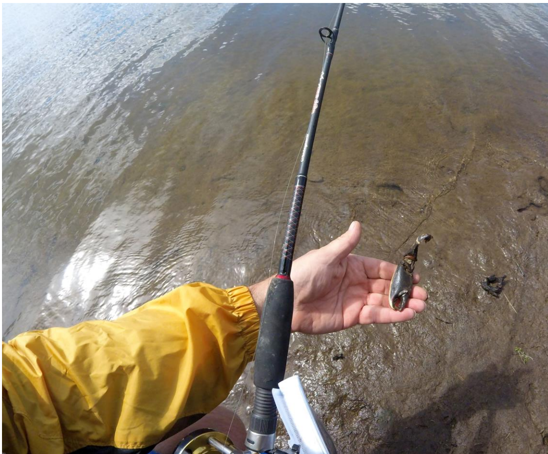
Leftovers from some-one else's lunch.