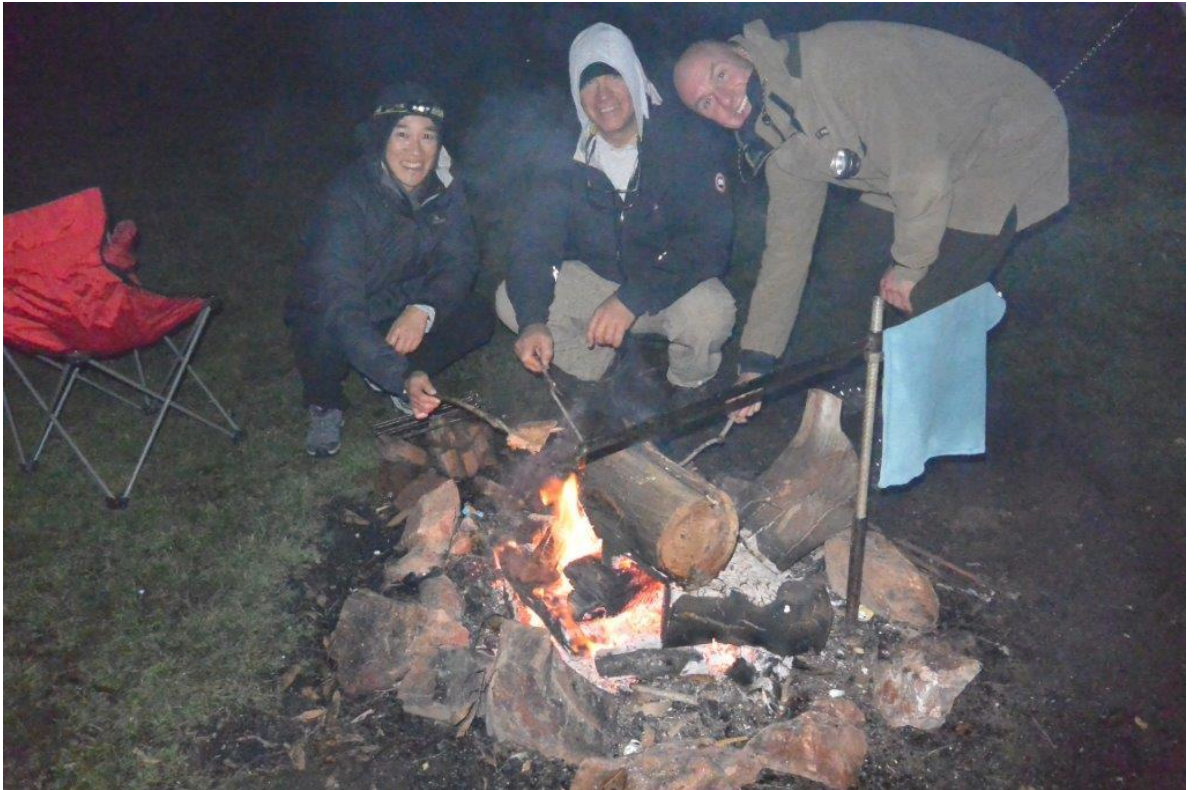
As the sun sunk below the horizon we all gathered at the campsite, stoked up the fire and enjoyed our dinner and good company. Here toasting some seasonal hot cross buns.