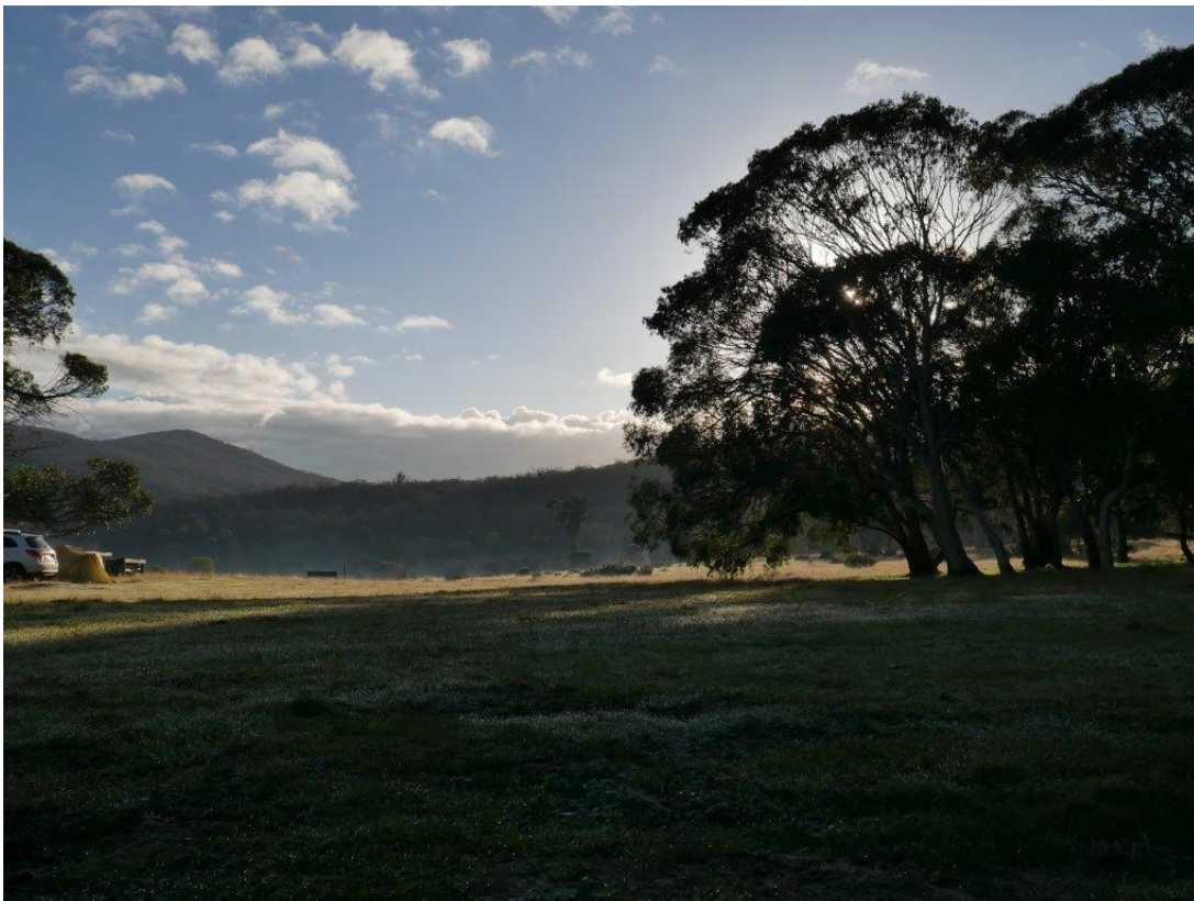
After a pleasant start .....