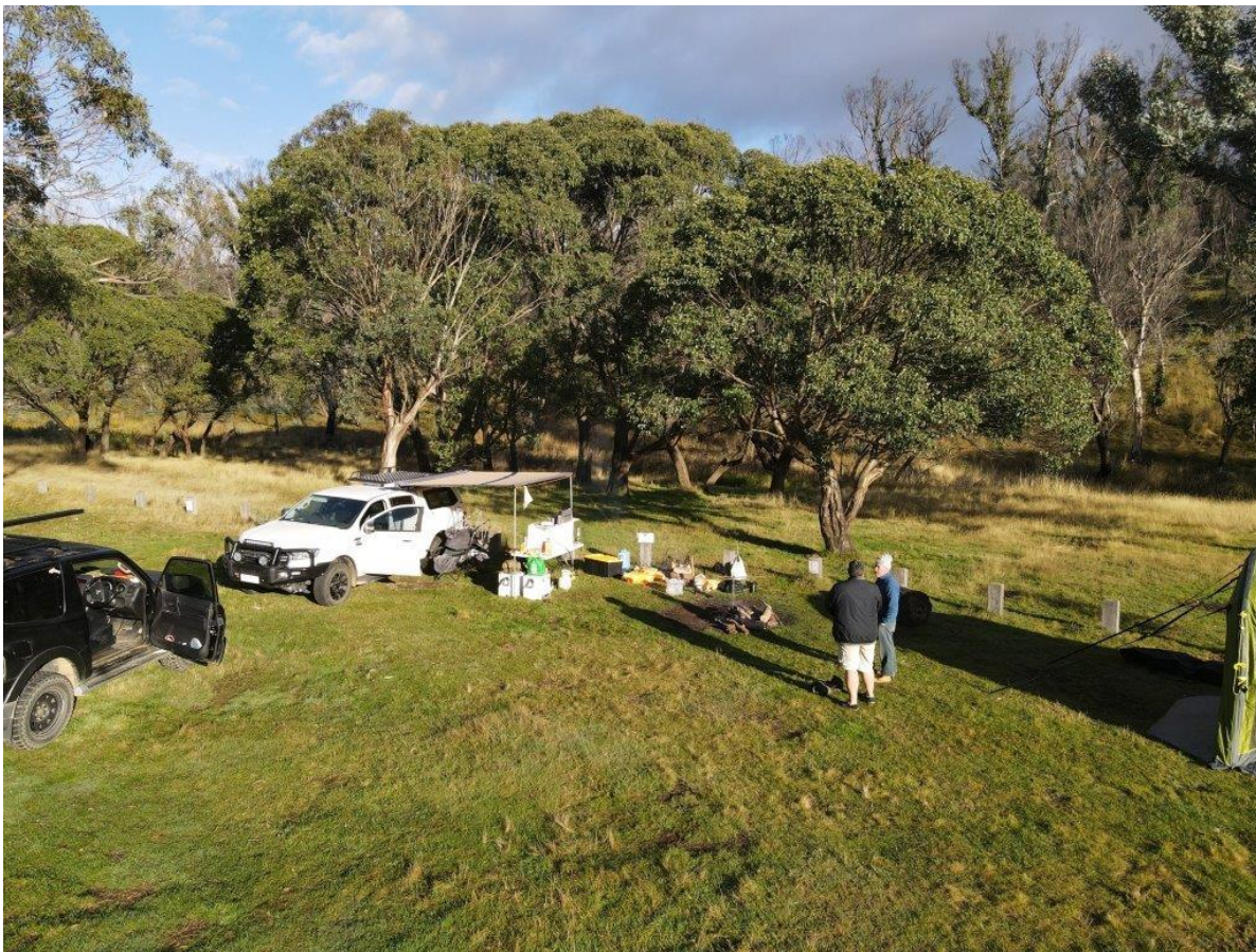
Wares Yard Campground