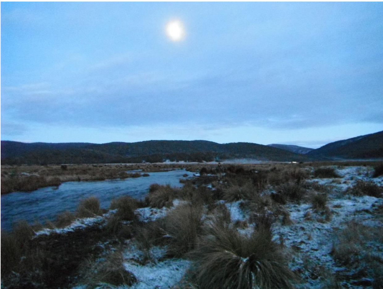
Moon setting over Denison