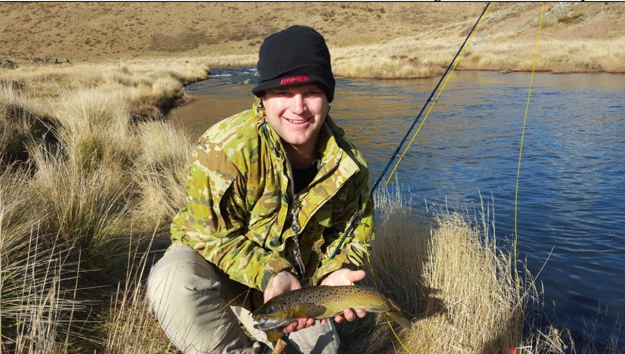
Pic of my first client on the Eucumbene ... Kidding it's my Brother in-law!