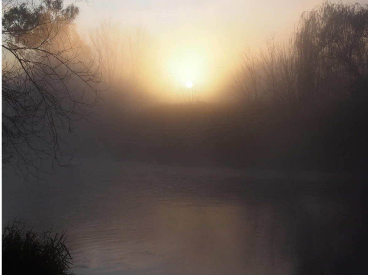
A very atmospheric image from Stefan – Tumut Outing May 2015

In This Issue (now with clickable links to jump straight to the segment):