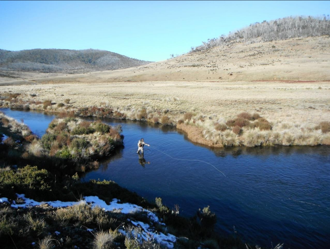
Geoff on the water – nice cast, deserved a fish