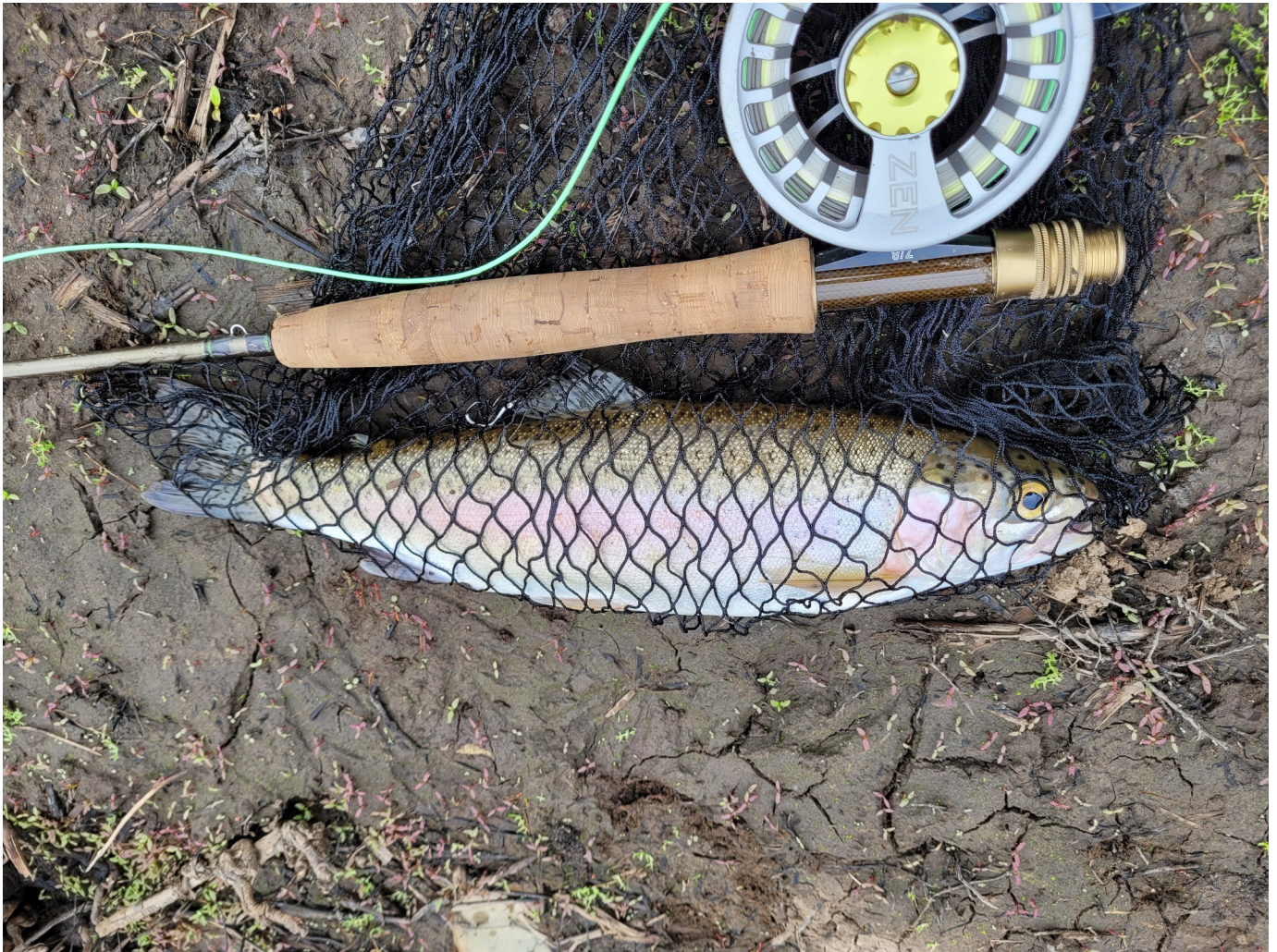
Best rainbow (measured) from Bill – you can see the circle hook that the fish had expelled – the line was still out of her mouth complete with a swivel.

Working upstream proved very productive, especially for Bill. He rated the morning as perhaps the best fishing he's had in Australia (in respect to numbers) and he gave up counting fish – all but the rainbow above on the dry, the browns almost exclusively in the 25-30cm range.