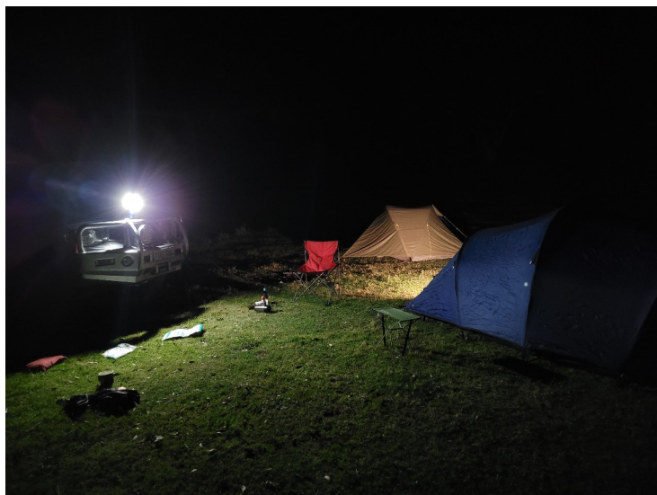
Our cosy campsite

The clouds were threatening at dusk, but rain didn't eventuate overnight. "Red sky at night ..."