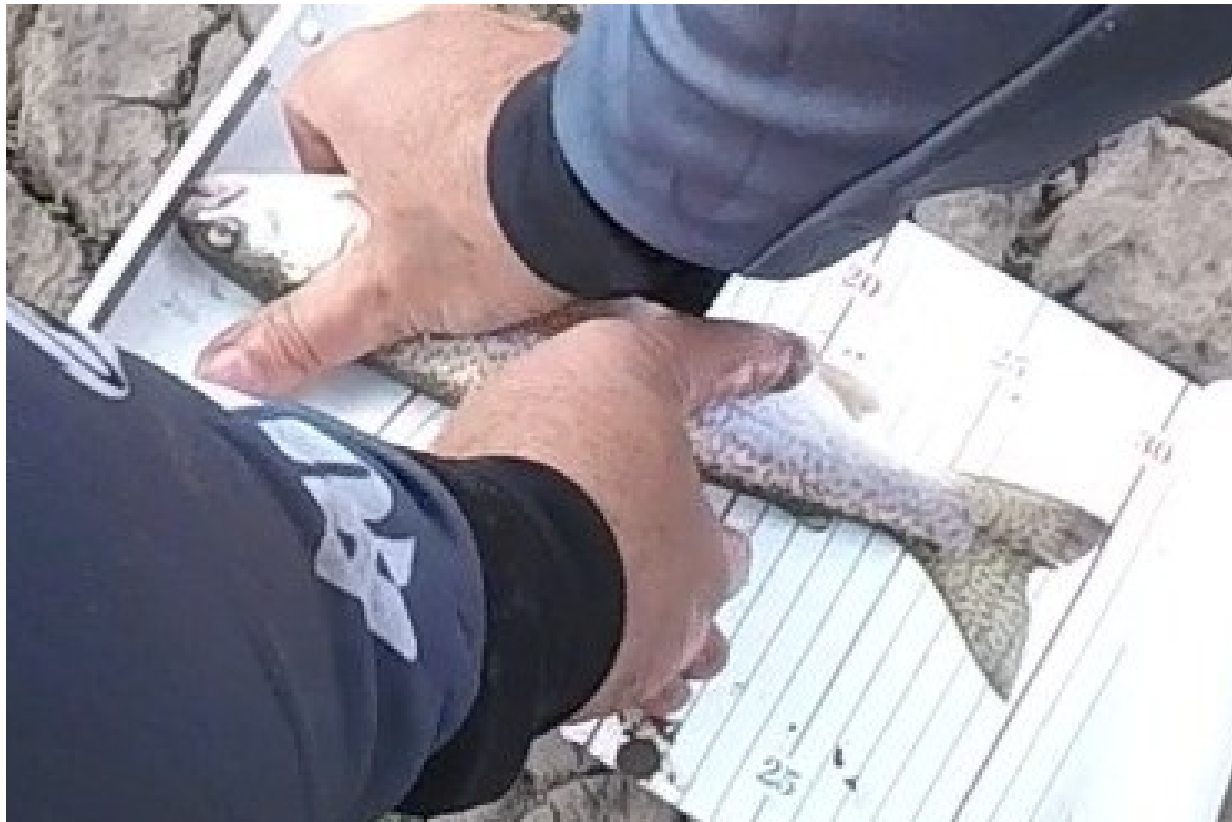
Jason's rainbow, and subsequent release