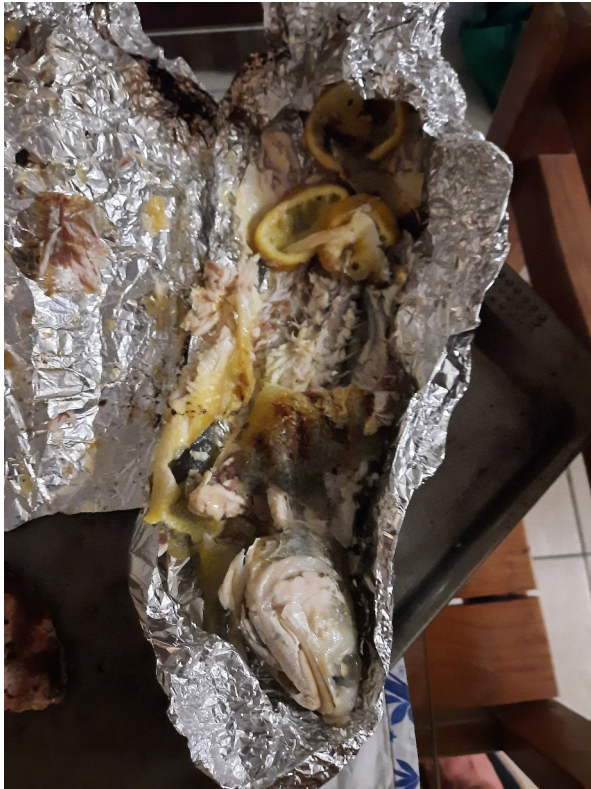
Salmon showing a bit of cheek....

Alas, no barra or mangrove jack, but a fun day out whilst catching up. Maybe next time it will be calm enough to get to Great Keppel Island.