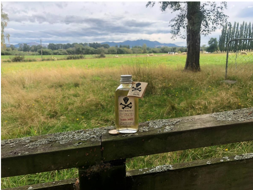
The bottle with the eponymous hills on the skyline.