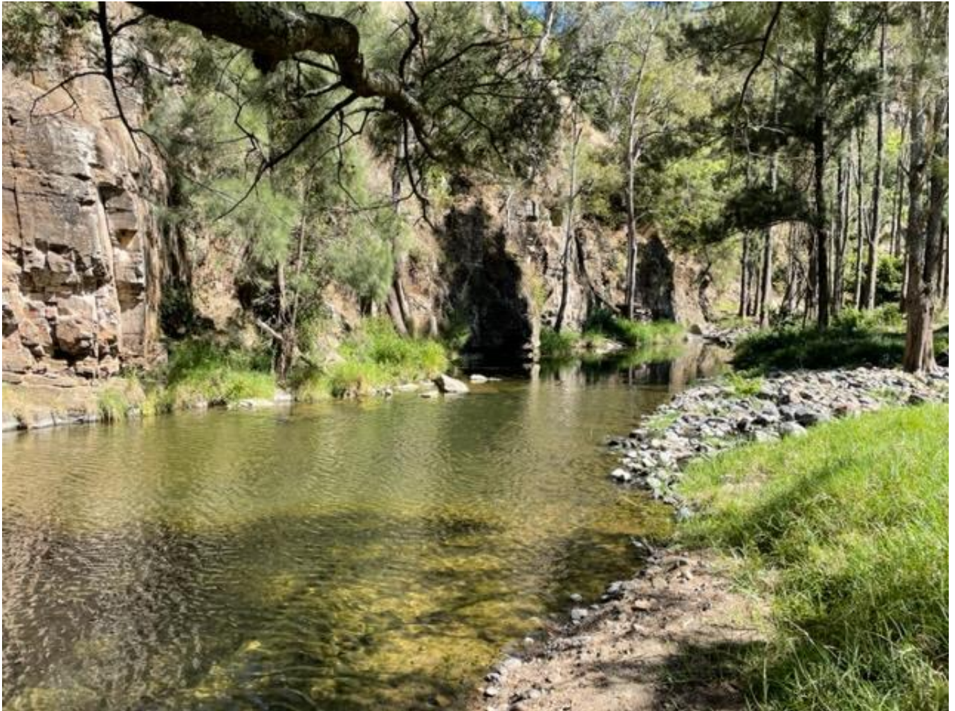
Deep pool - upper Rouchel Brook