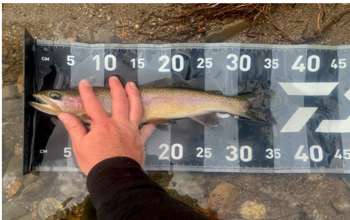
One of the larger fish I caught.