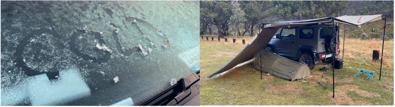
We were welcomed on Sunday morning by snow or sleet leftovers