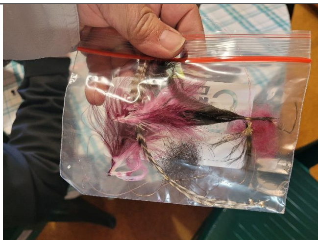
The materials baggie