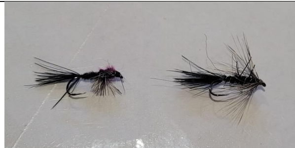
Ties were various designs wets & nymphs with one very attractive para adams.

Results: unofficial pre-comp captured from shore of estimated 37cm on claret bead headed spider by Paul (Bill claims it was the same hen as caught on Friday night). Ryan dropped one then BJ landed 35cm. Claude dropped two? Otherwise BJ won the day. During Bill's time on water BJ rubbed salt into the wounds by landing one.