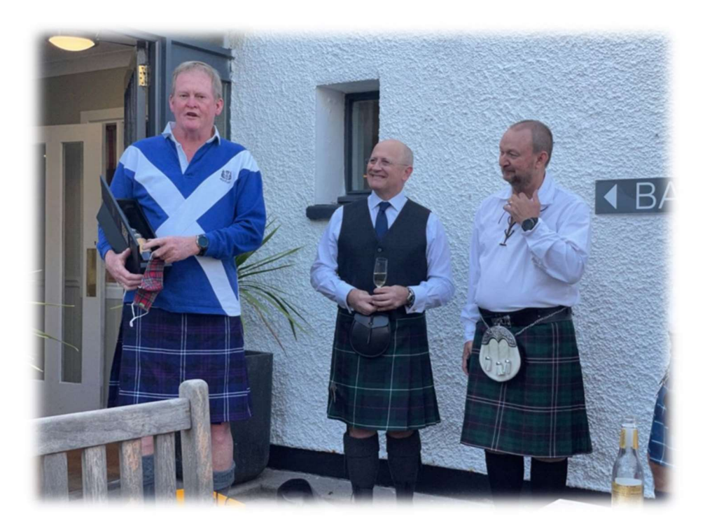
Just a bit more Glenmorangie Signet to be consumed.