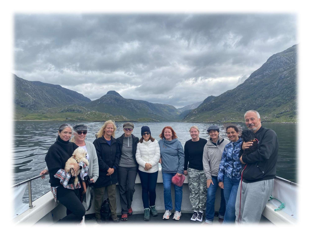
The Ladies enjoying a cruise one of many Scotland's Loch's.