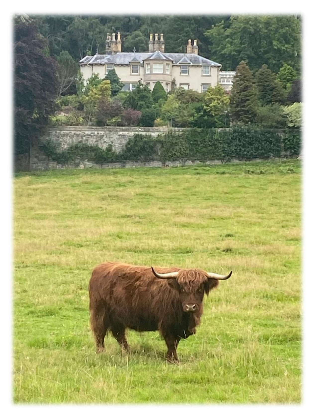
Then who could forget the Hairy Coo!!