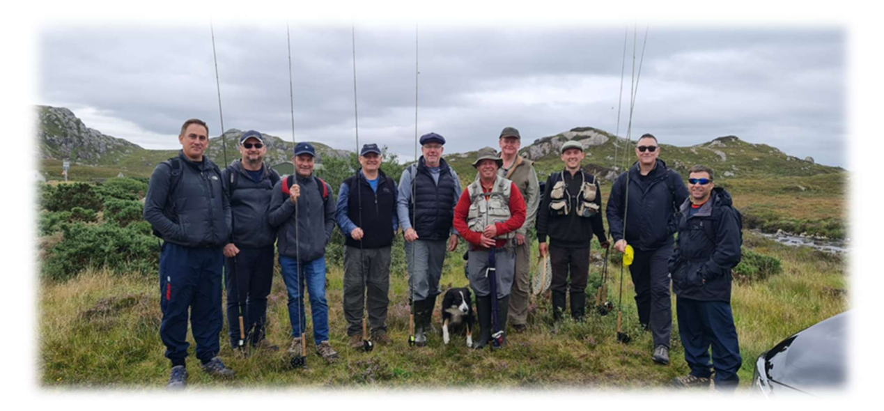
Our group: New Zealand, American, Canadian, Australian and two local Ghillies.